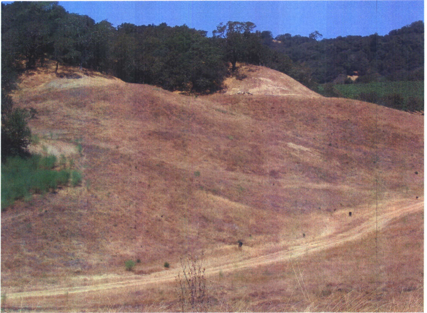
Proposed Place of Use (typical)