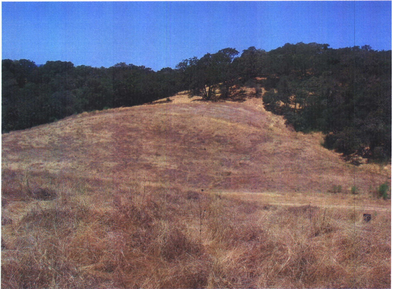
Proposed Place of Use (typical)