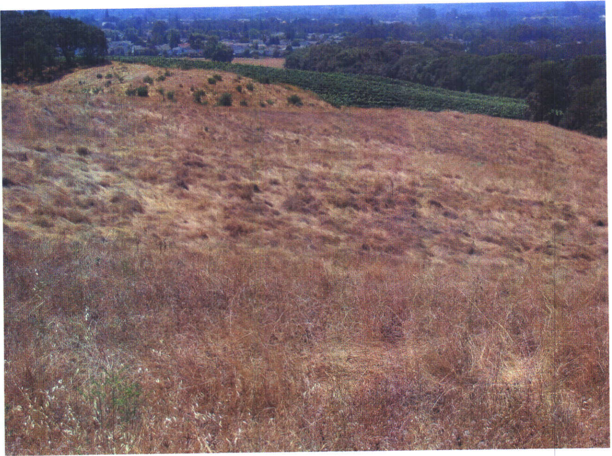
Proposed Place of Use (typical)