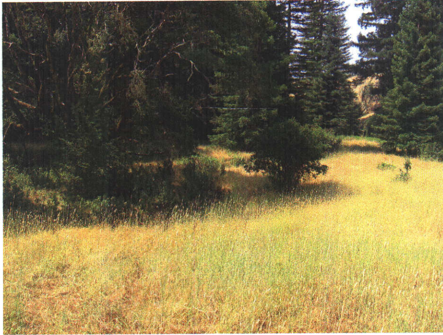
POD #1 at dam looking downstream