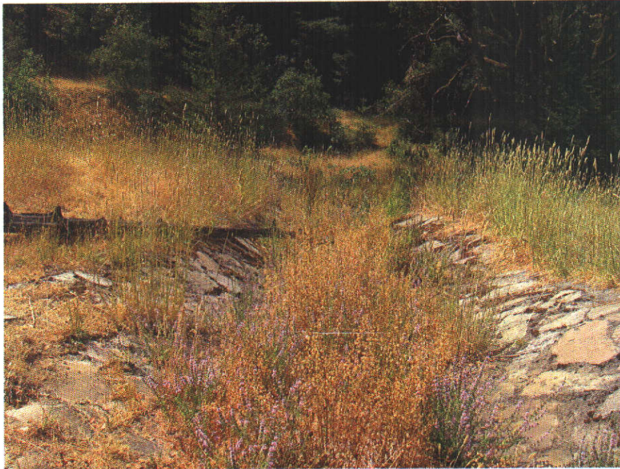
POD #1 spillway looking downstream