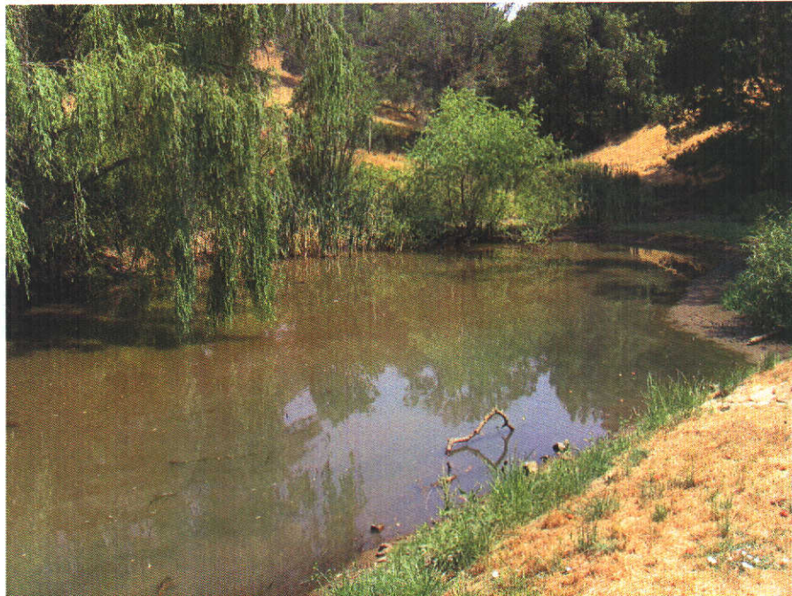
POD #3 looking upstream