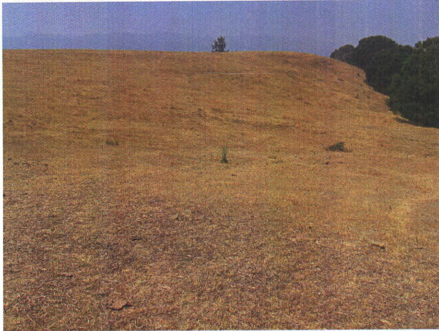
Permitted Place of Use – not planted (typical)