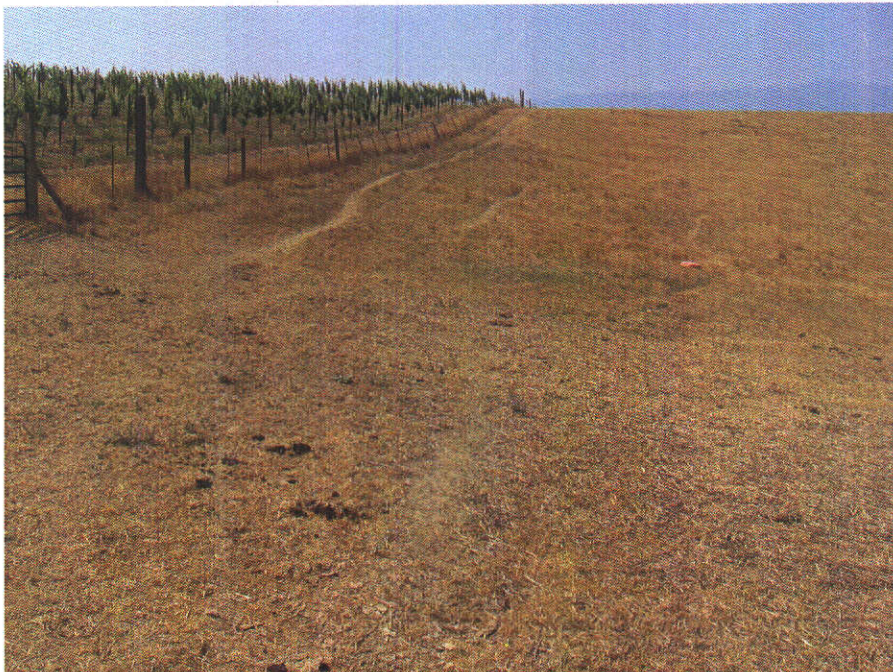
Permitted Place of Use not developed and existing vineyard