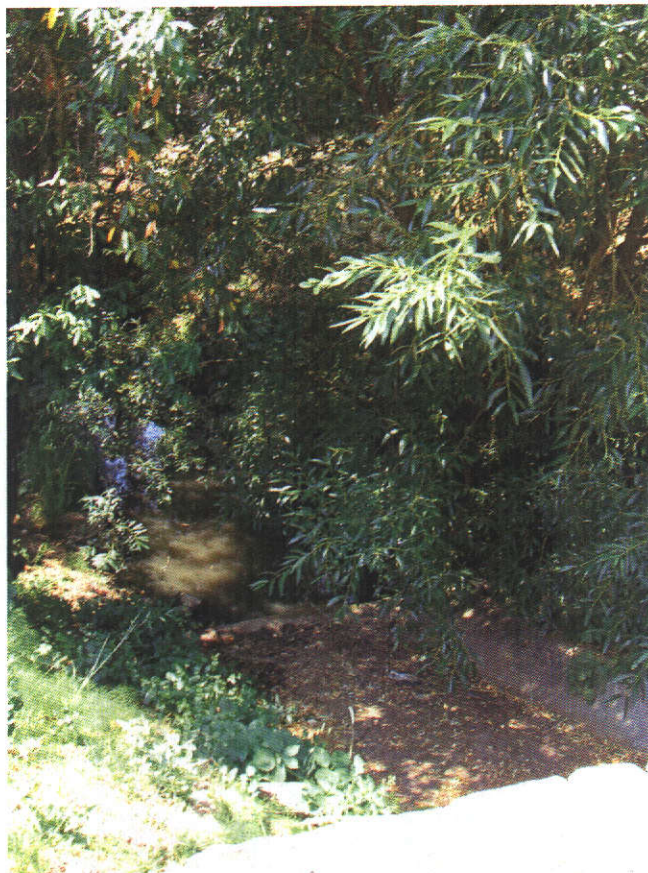
POD #3 at dam looking downstream