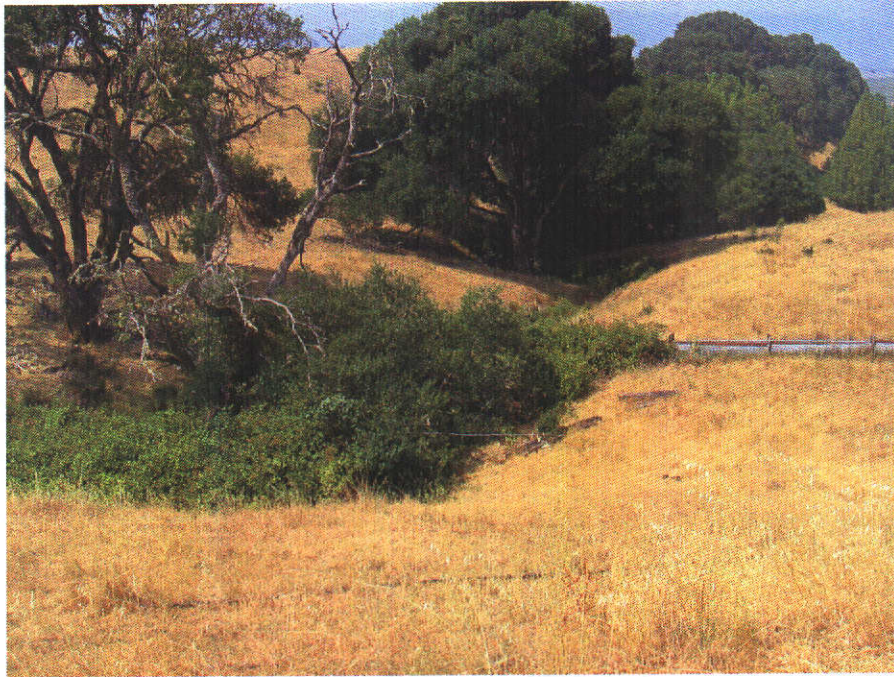
POD #2 at dam looking downstream