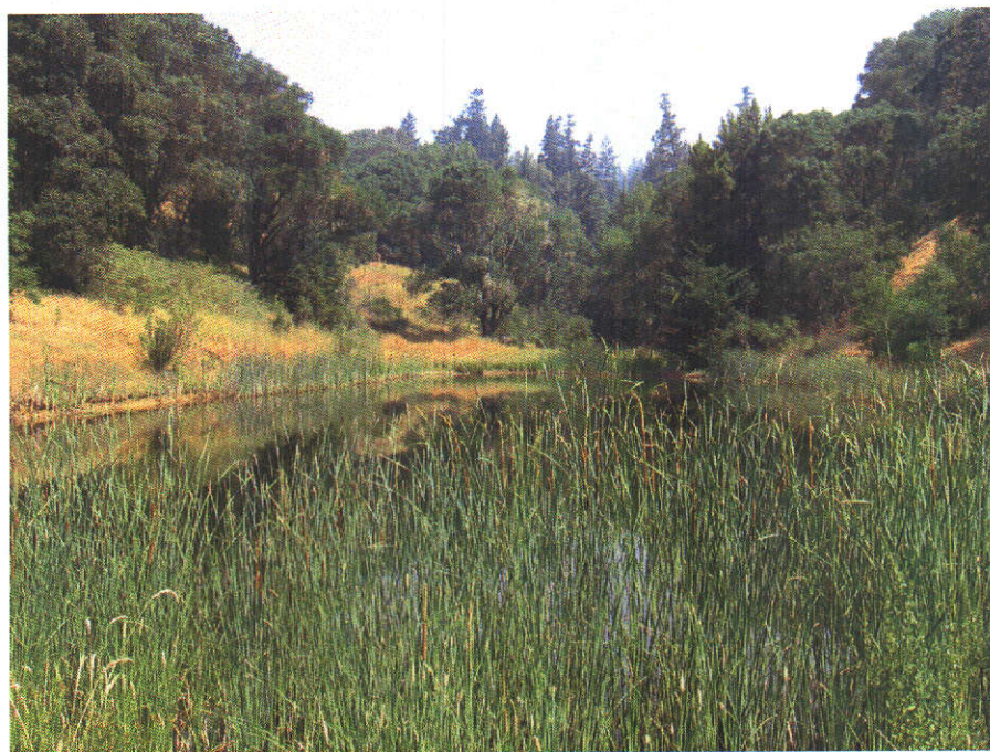
POD #1 at dam looking upstream