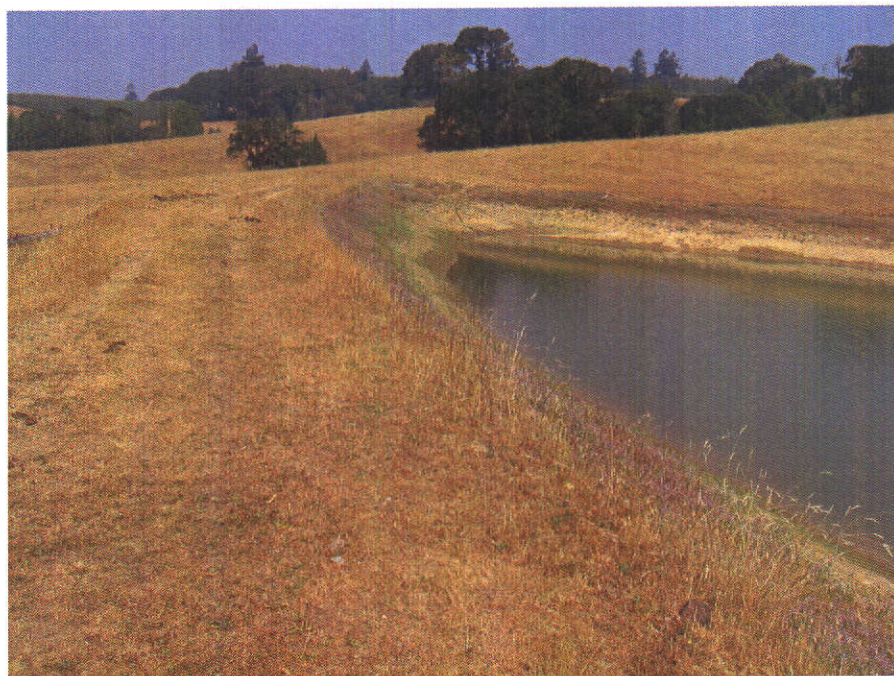
POD #2 dam