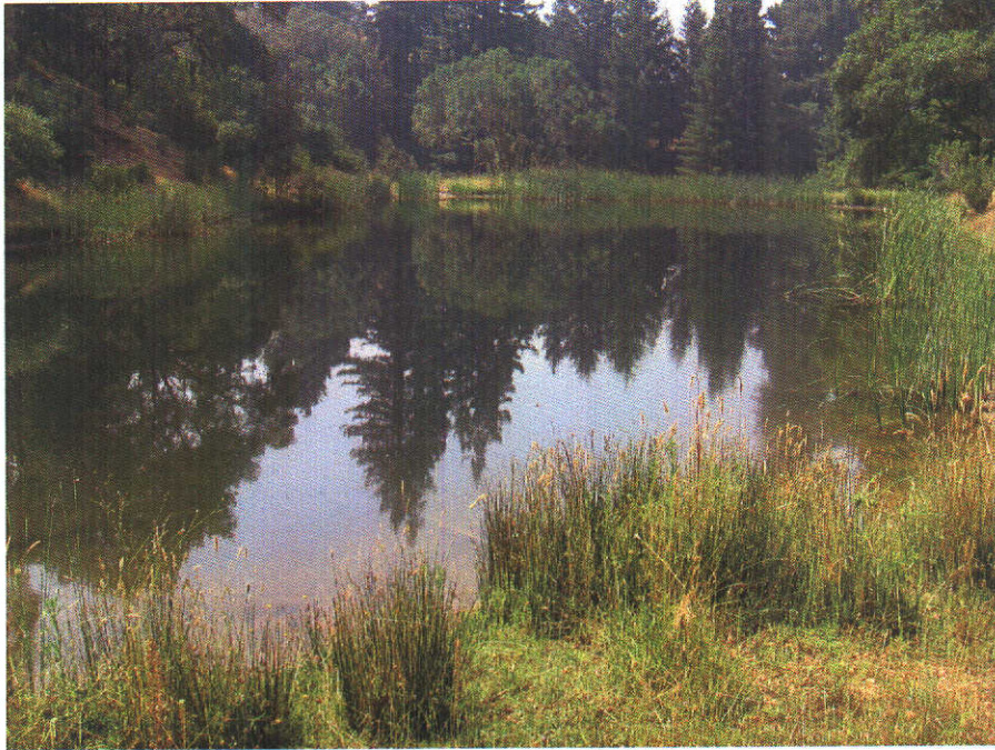
POD #1 top of reservoir looking downstream at dam