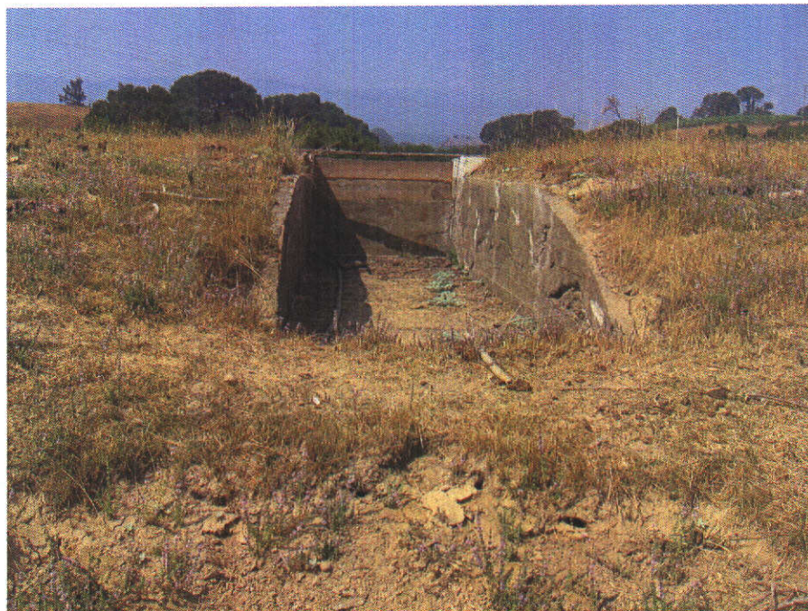
POD #2 spillway