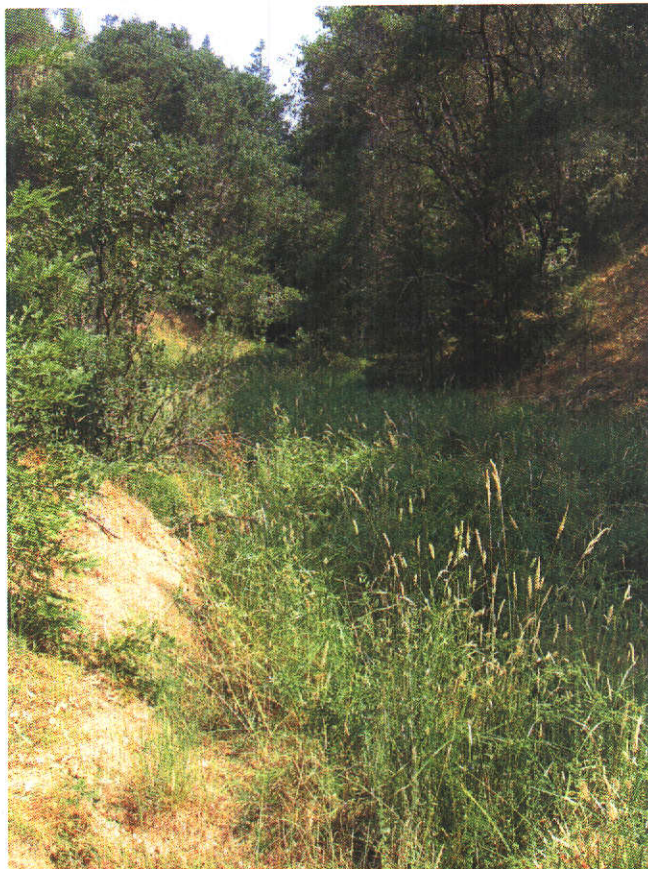
POD #1 top of reservoir looking upstream