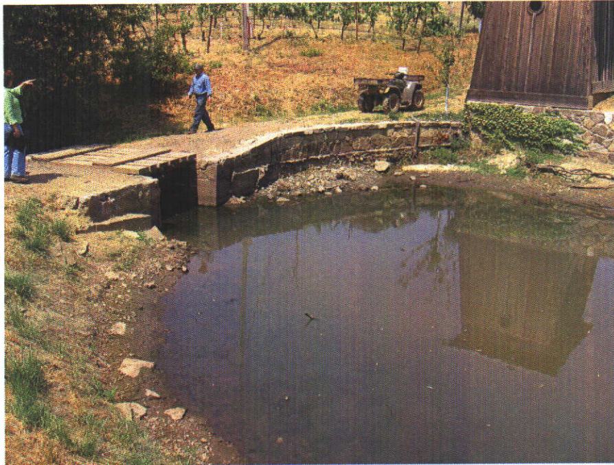
POD #3 dam