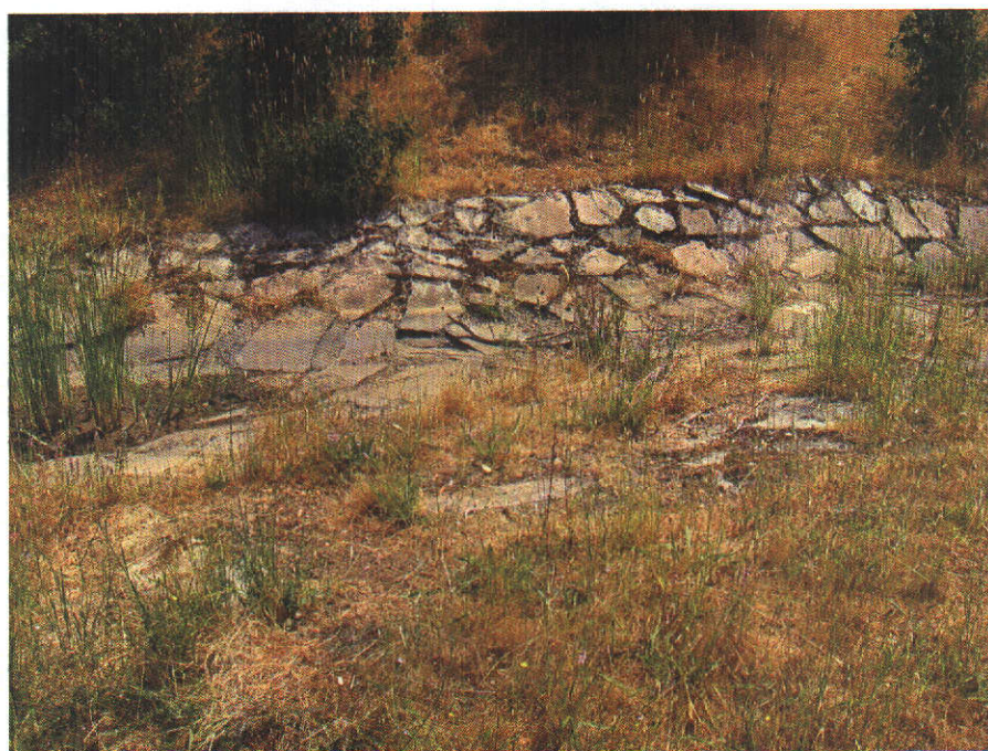
POD #1 spillway