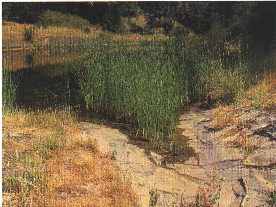
POD #1 spillway looking upstream