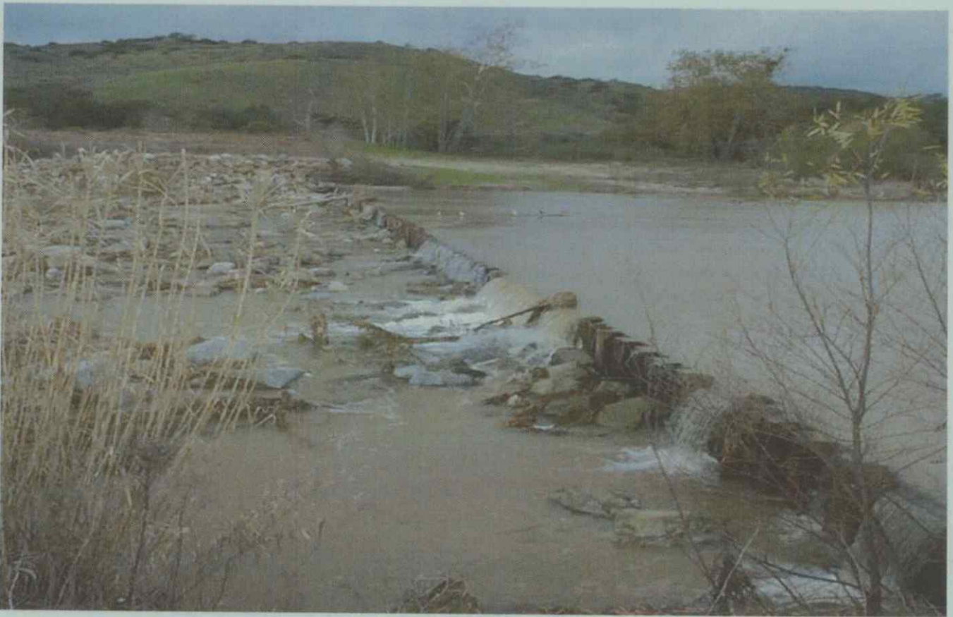
Point of Diversion #1