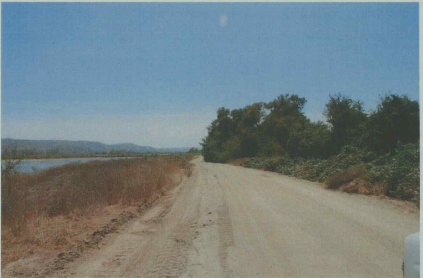
Point of Diversion #2 (Gallery Well Field) - Typical