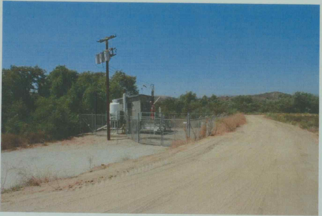
Point of Diversion #3 (Production Well Field) – Typical Well