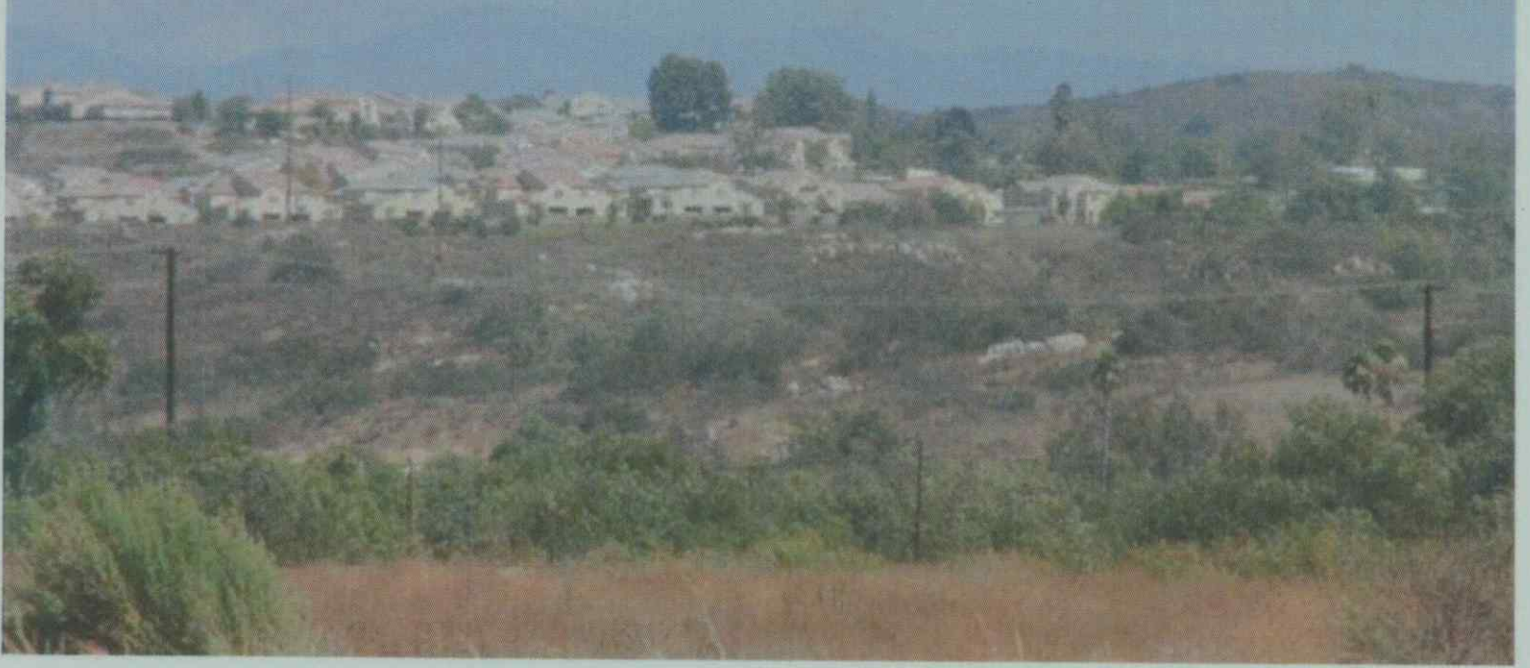
Fallbrook Public Utility District- Typical Place of Use