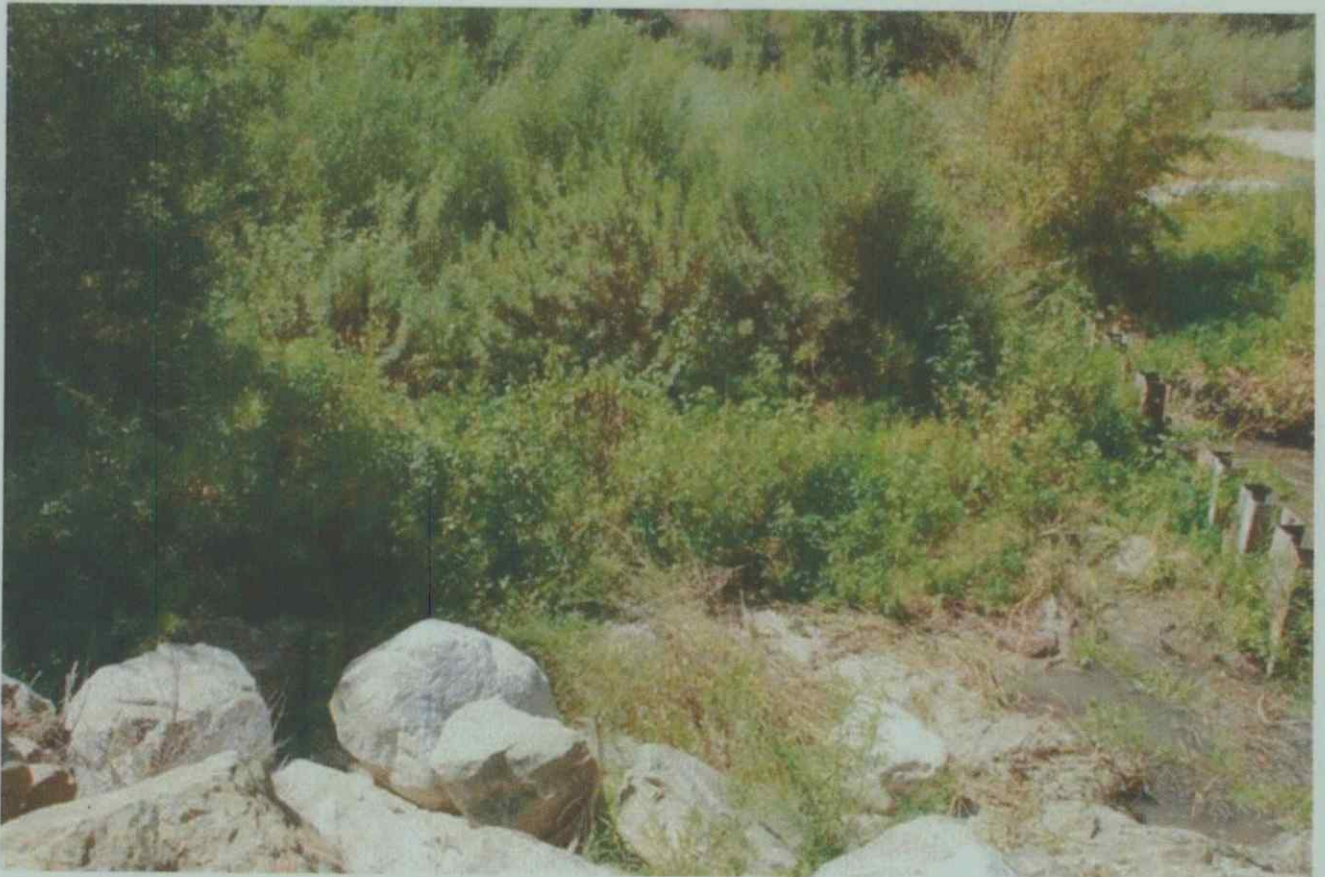
Point of Diversion #1 (Looking Downstream)