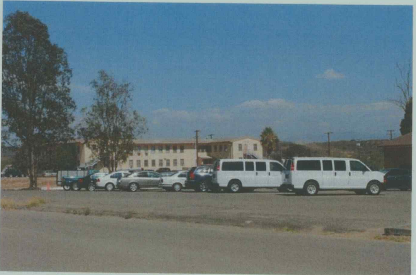
Camp Pendleton – Typical Facilities