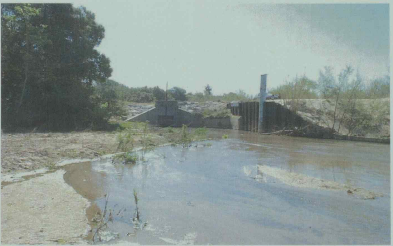
Point of Diversion #1 (Headgate to O'Neill Ditch)