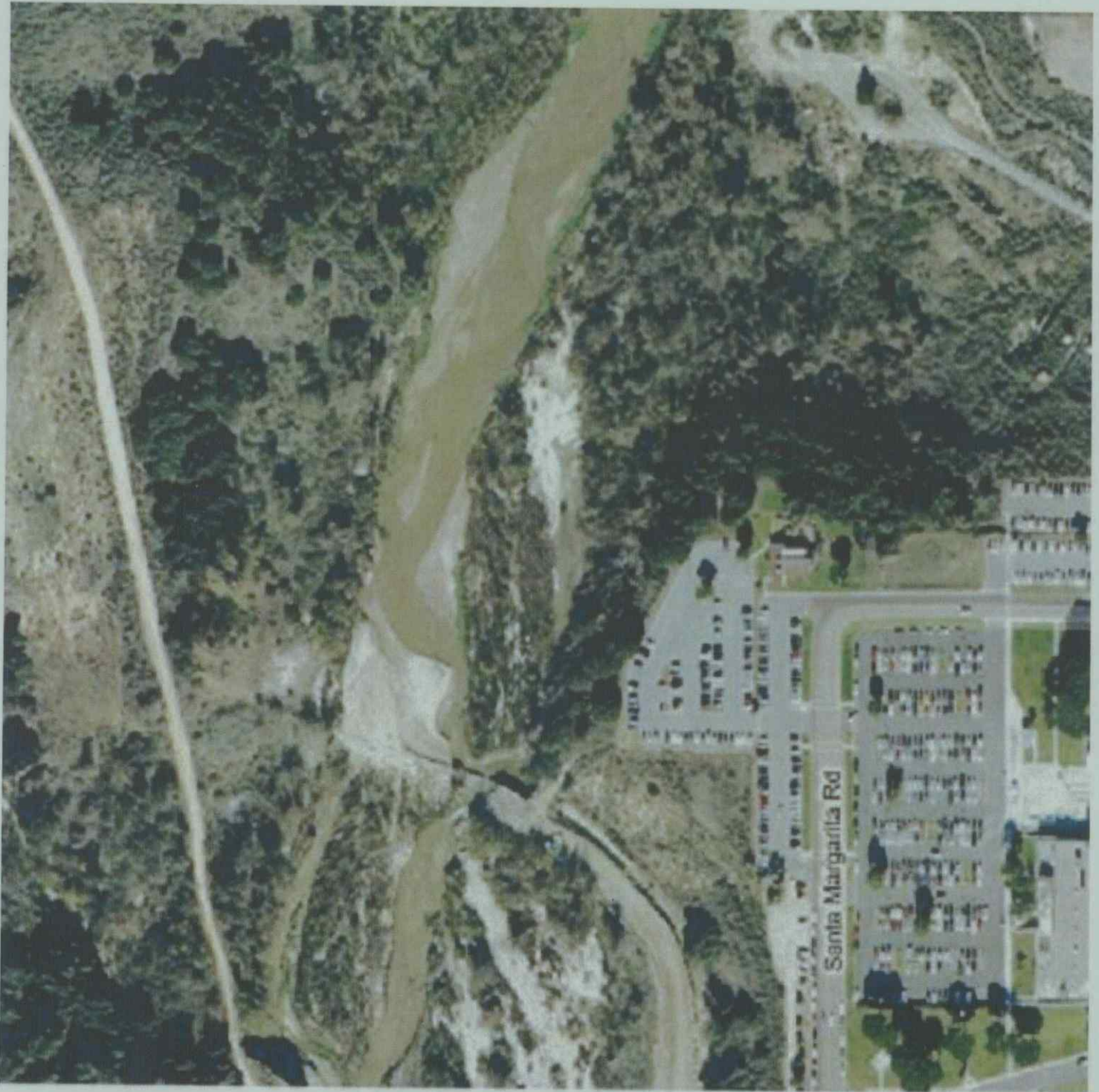
Point of Diversion #1 and Typical Camp Pendleton Facilities

Permit 15000 (Application 21471B) of U.S. Bureau of Reclamation (Camp Pendleton Naval Enclave)