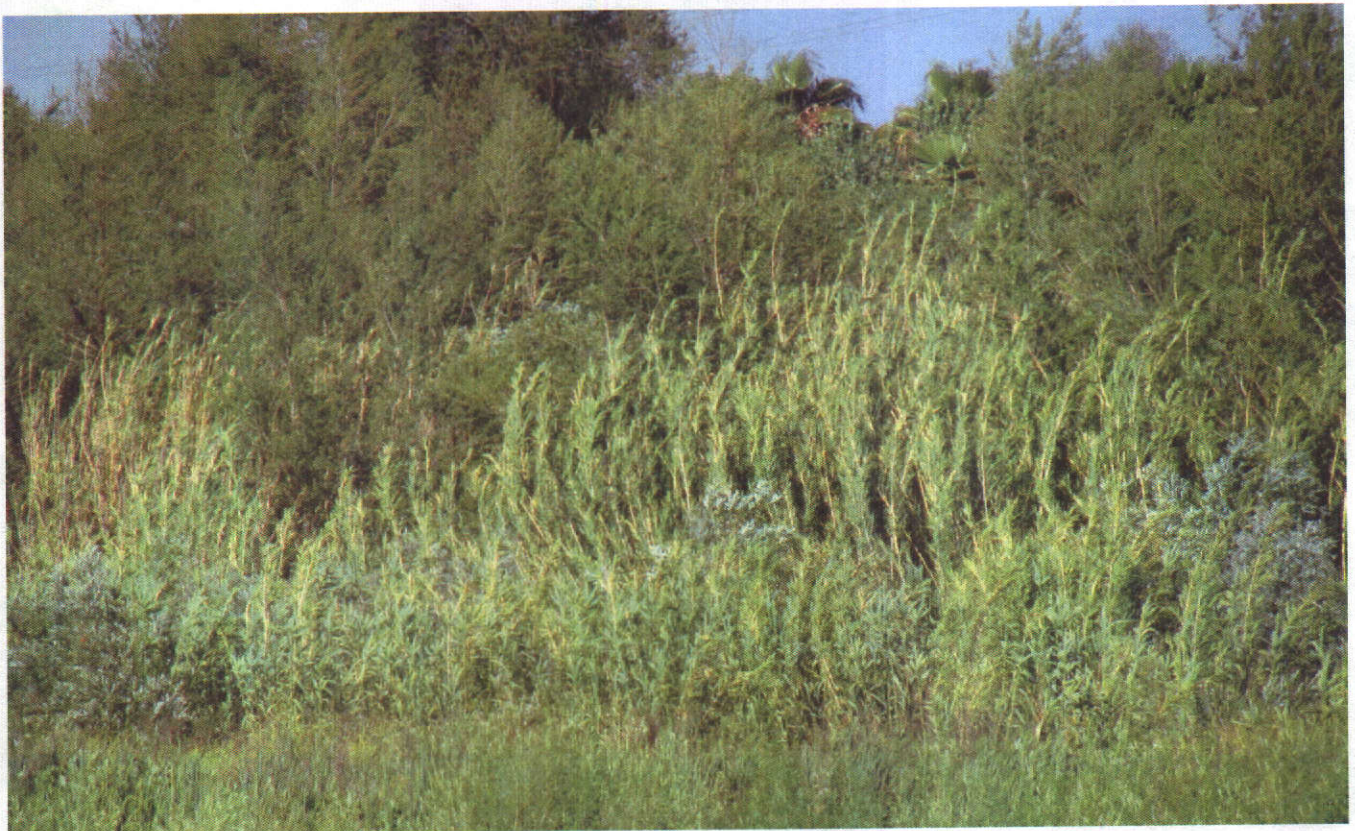
Photograph 4: Invasive Arundo