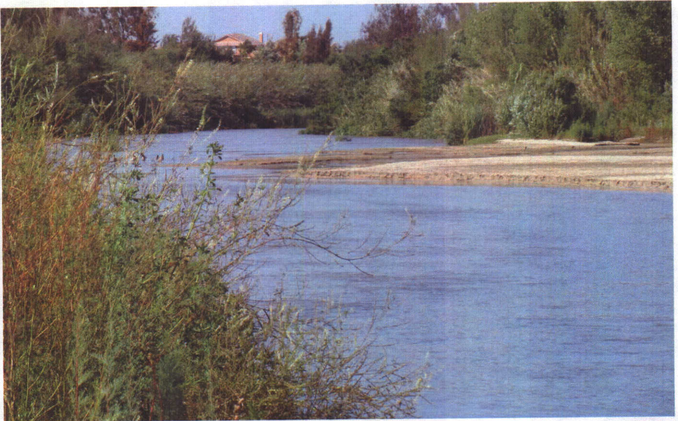
Photograph 3: In-Stream Habitat