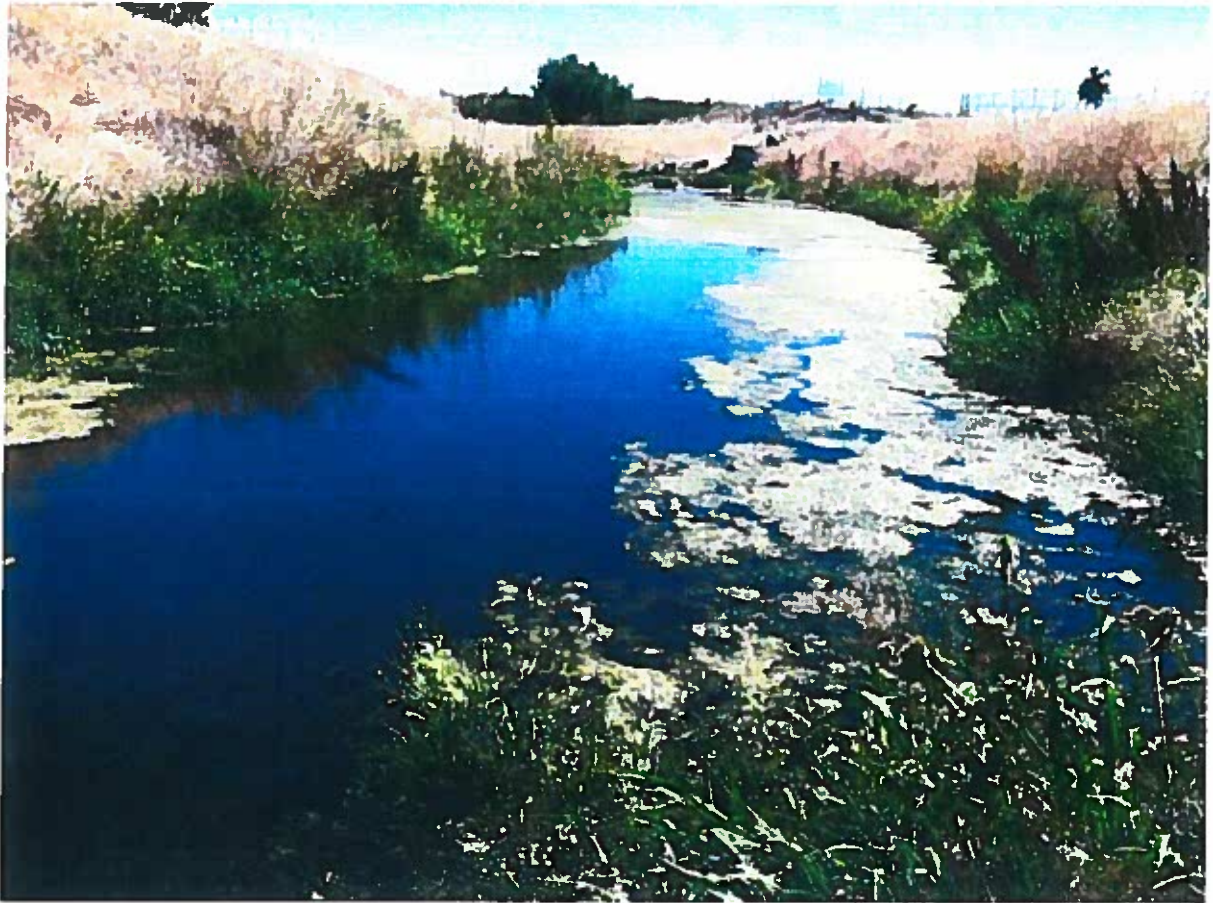
Figure 3. Vegetation existing along Marsh Creek immediately upstream from existing outfall (looking downstream towards outfall). Taken June 30, 2014.