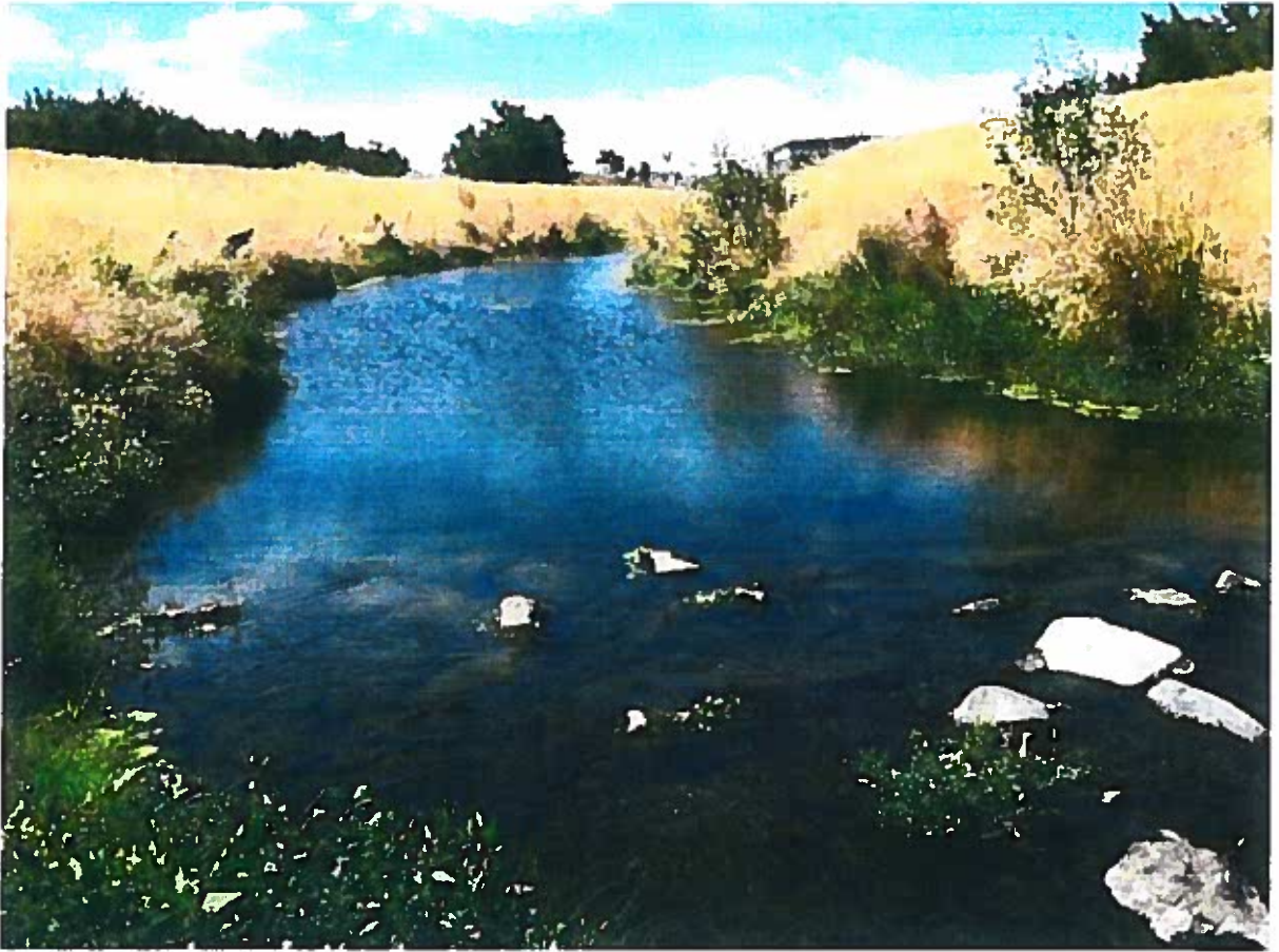
Figure 4. Vegetation existing along Marsh Creek immediately downstream from existing outfall (looking upstream towards outfall). Taken June 30, 2014.