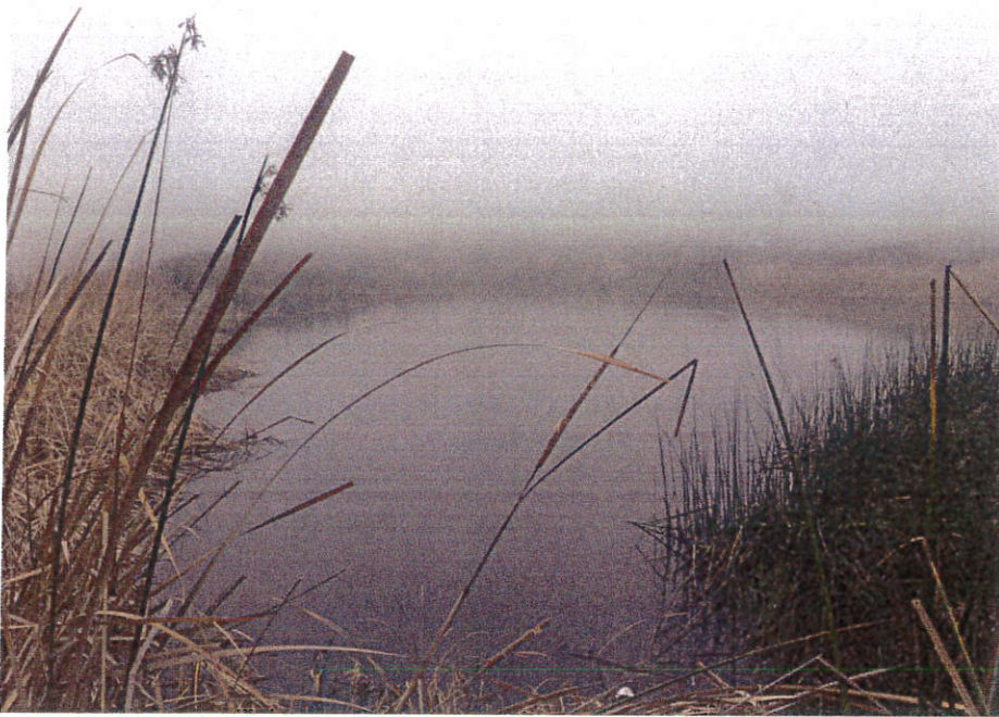
Photo # 2 – proposed pond site (enlarging footprint of existing pond)