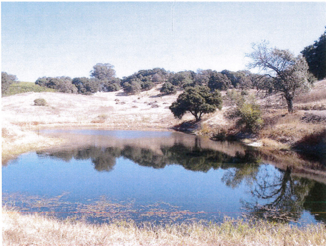
Typical Unplanted Place of Use (cleared area above pond)