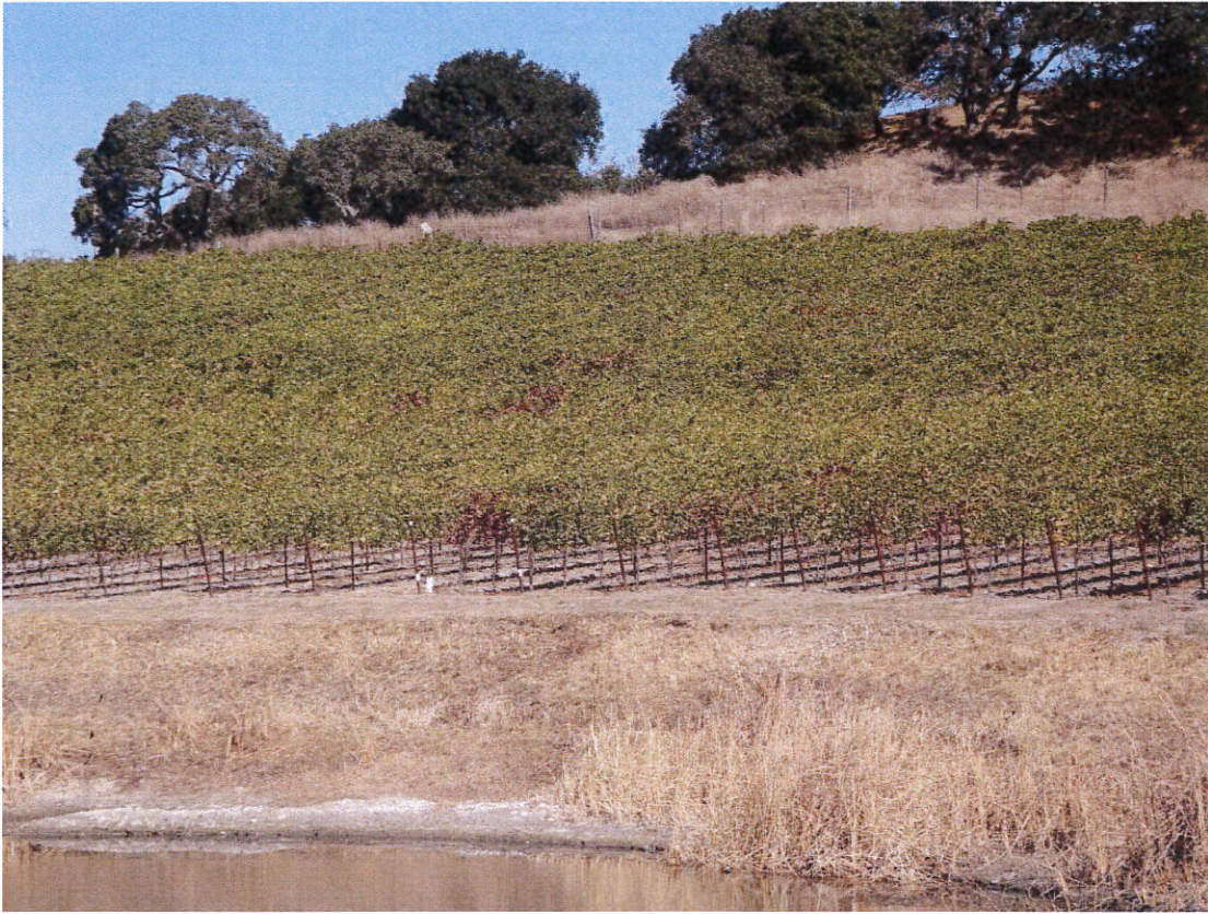
Typical existing Place of Use