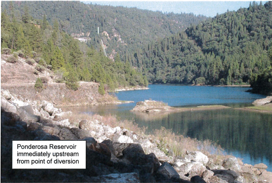
Ponderosa Reservoir immediately upstream from point of diversion