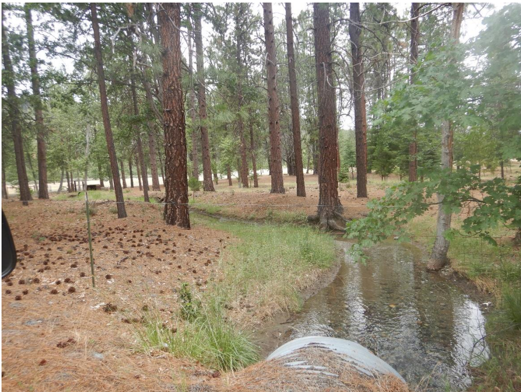
July 5 photograph showing water in the ditch