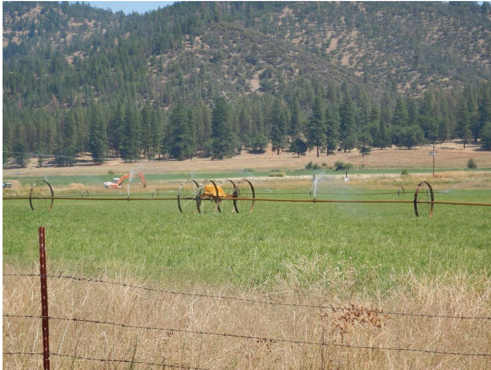
August 19 photograph showing irrigation at the Place of Use