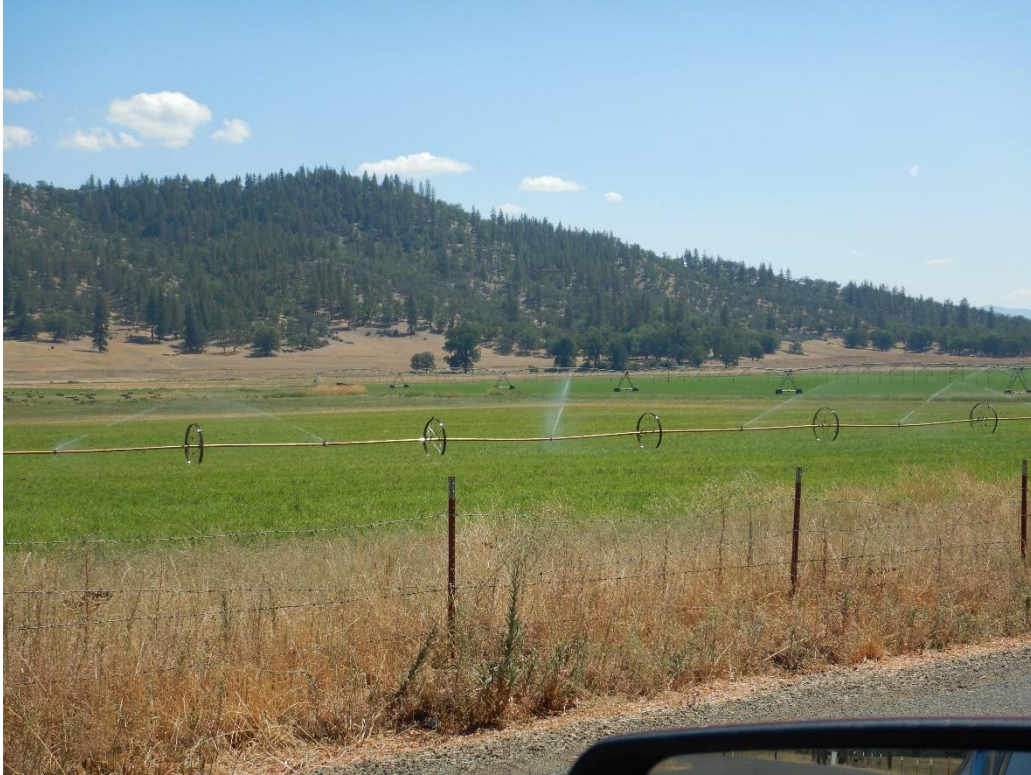
August 19 photograph showing irrigation at the Place of Use