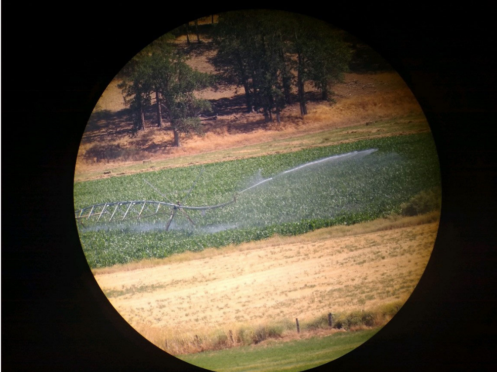
August 7 photograph showing active irrigation