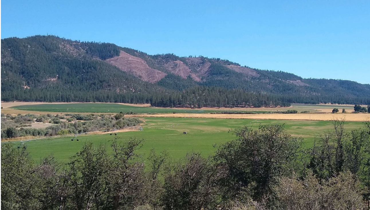
August 7 photograph showing active irrigation