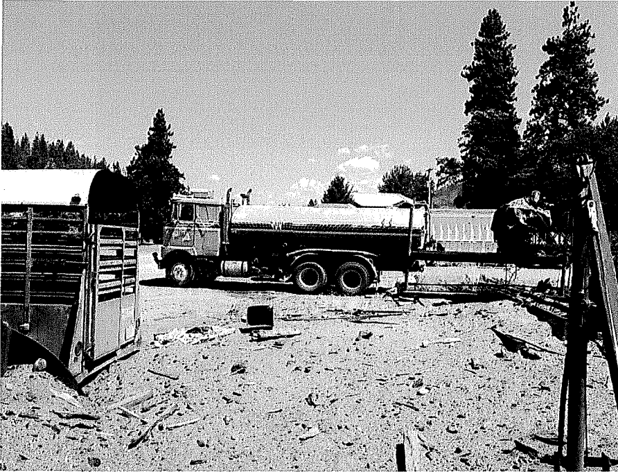
Photo 5 – Turquoise Wet Pup Trucking water truck owned by Hodgetts. In Hodgetts Lake and Streambed Alteration Agreement application Wet Pup Trucking is the name of Hodgetts business.