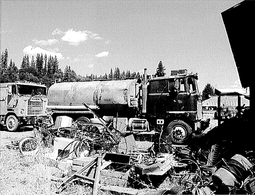
Photo 3 – According to the Department of Fish and Wildlife the Dark Green water truck license plate SE 364150 and the Turquoise water truck license plate SE510512 are owned by Hodgetts.