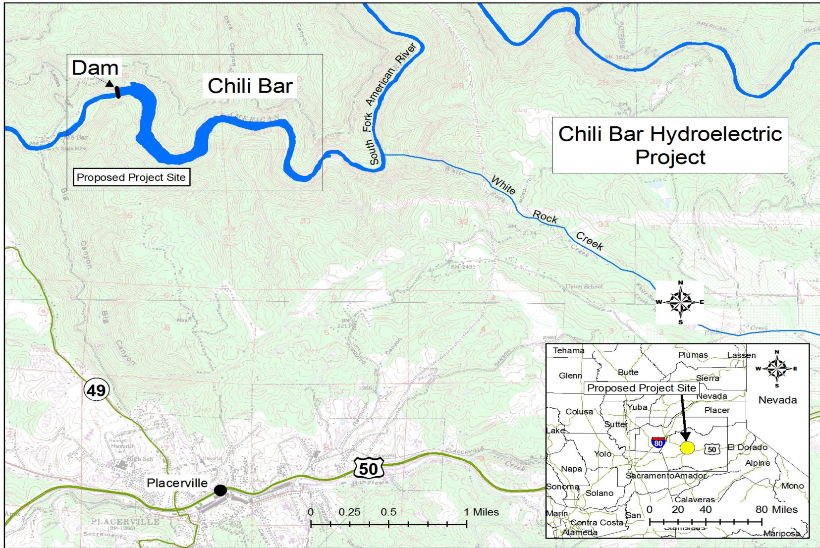
ATTACHMENT A - LOCATION MAP