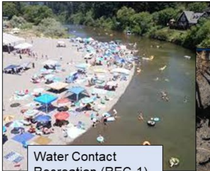
Water Contact Recreation (REC-1)