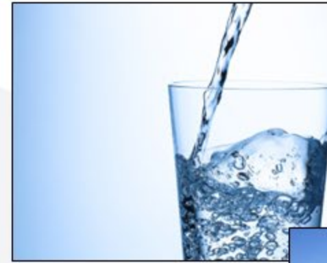
Municipal & Domestic Supply (MUN)