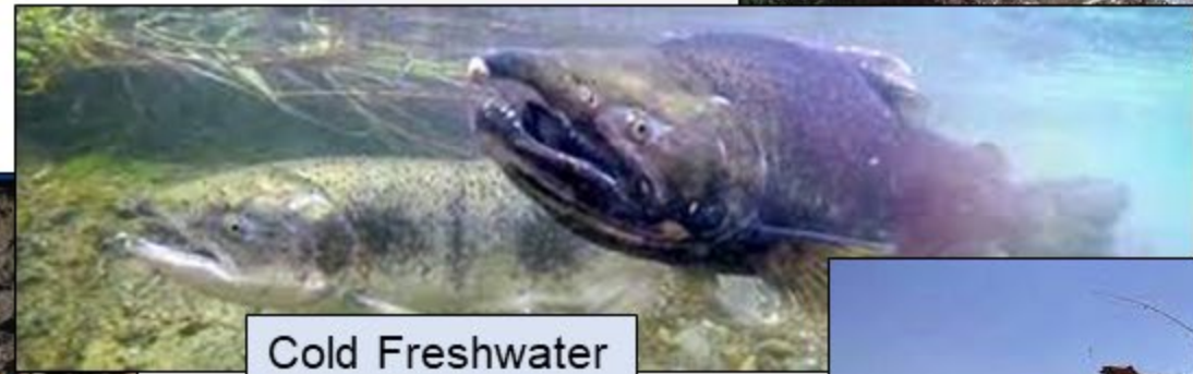
Cold Freshwater Habitat (COLD)