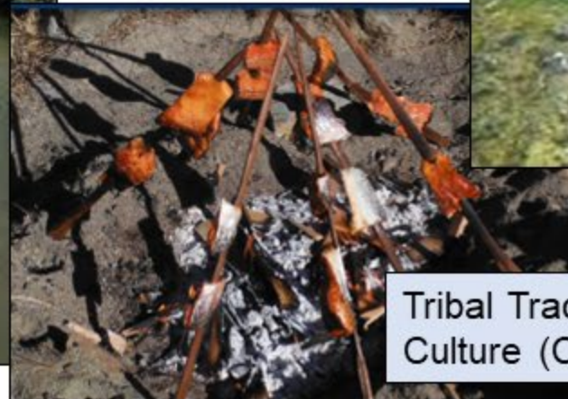
Tribal Tradition & Culture (CUL)