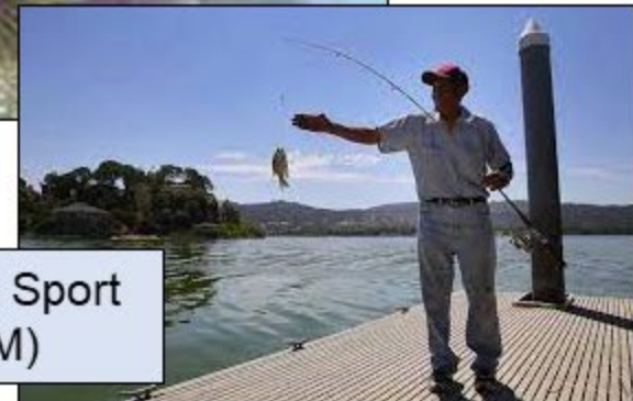
Commercial & Sport Fishing (COMM)