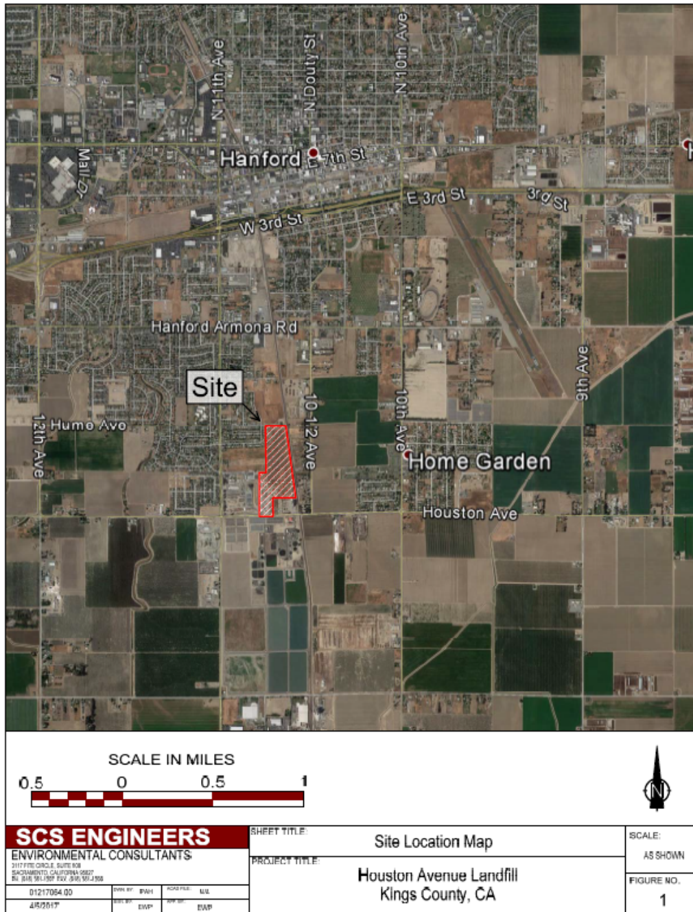
Site Location Map from First Semi-Annual Monitoring Report dated 1 August 2023