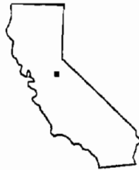
Attachment A Location of Jamestown Mine site