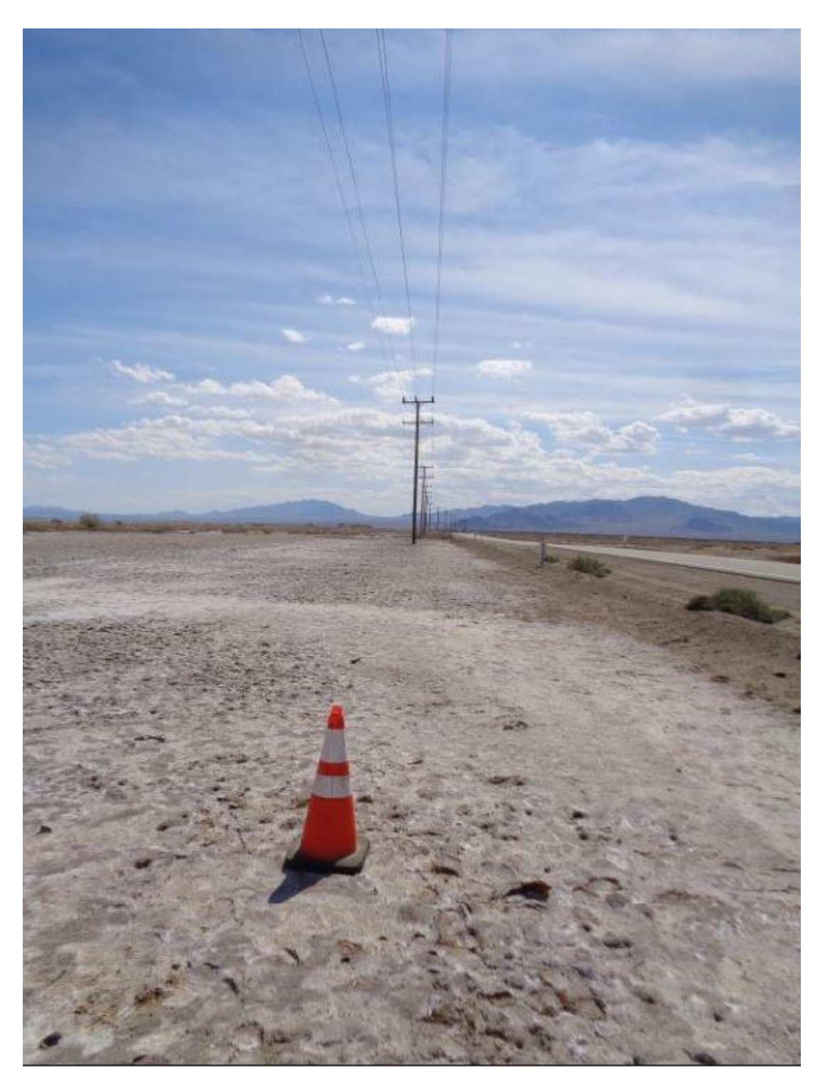
Photograph 1. Image of power poles being replace. Traffic cone shows location of a new pole installation.