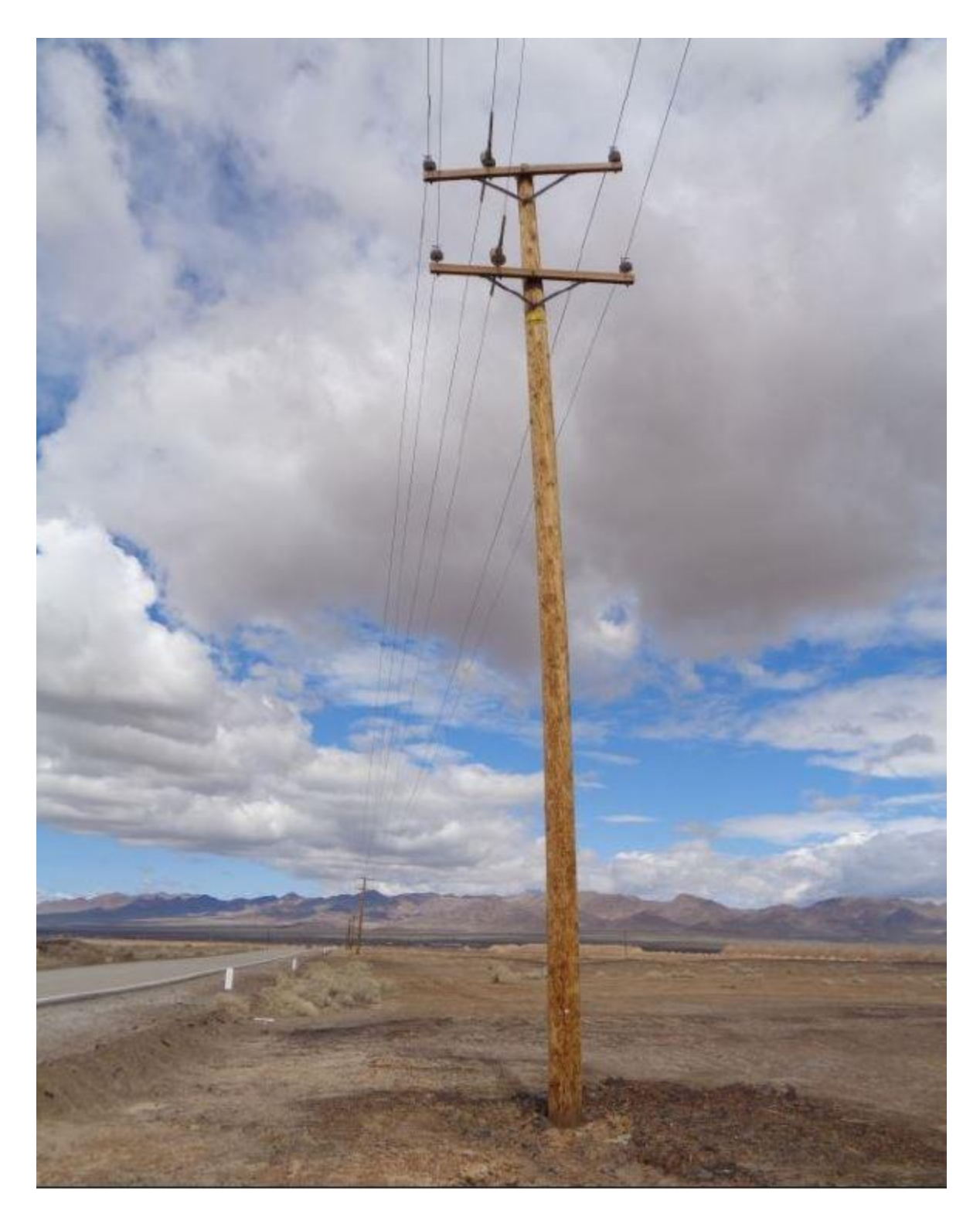
Photograph 3. Image of power poles being replaced.