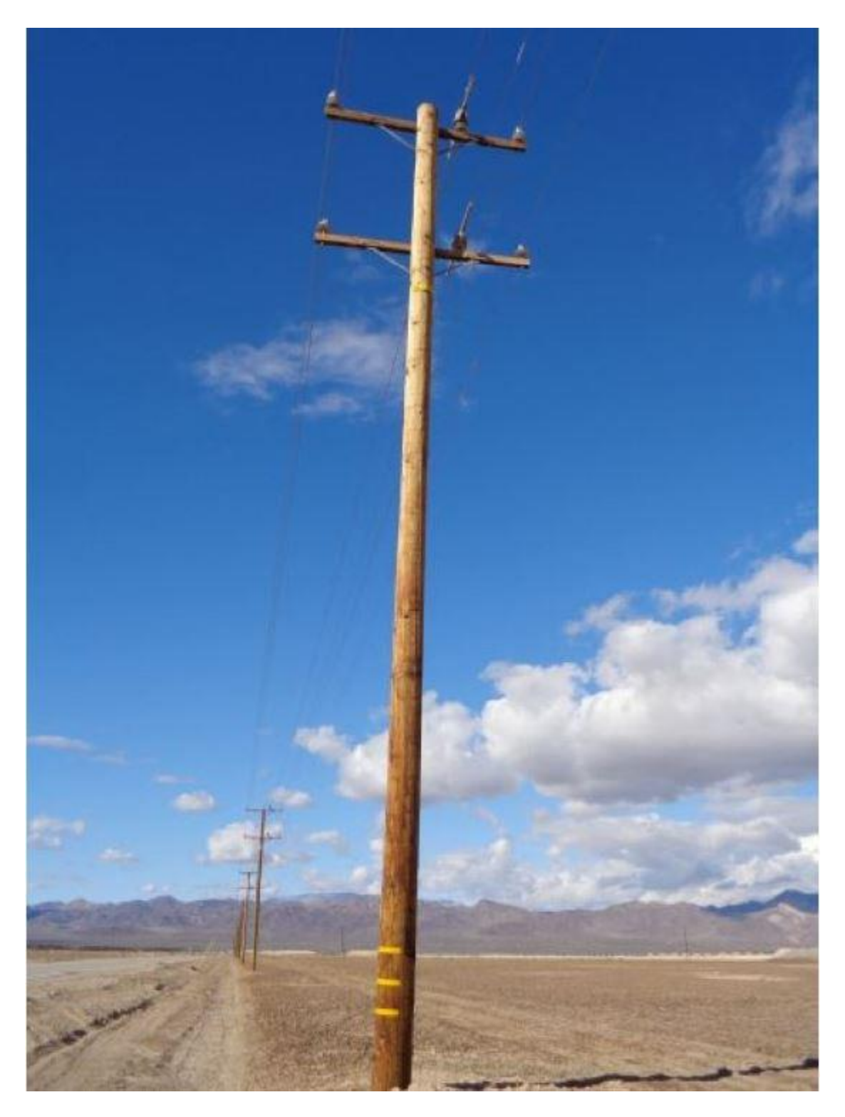
Photograph 2. Image of power poles being replaced.