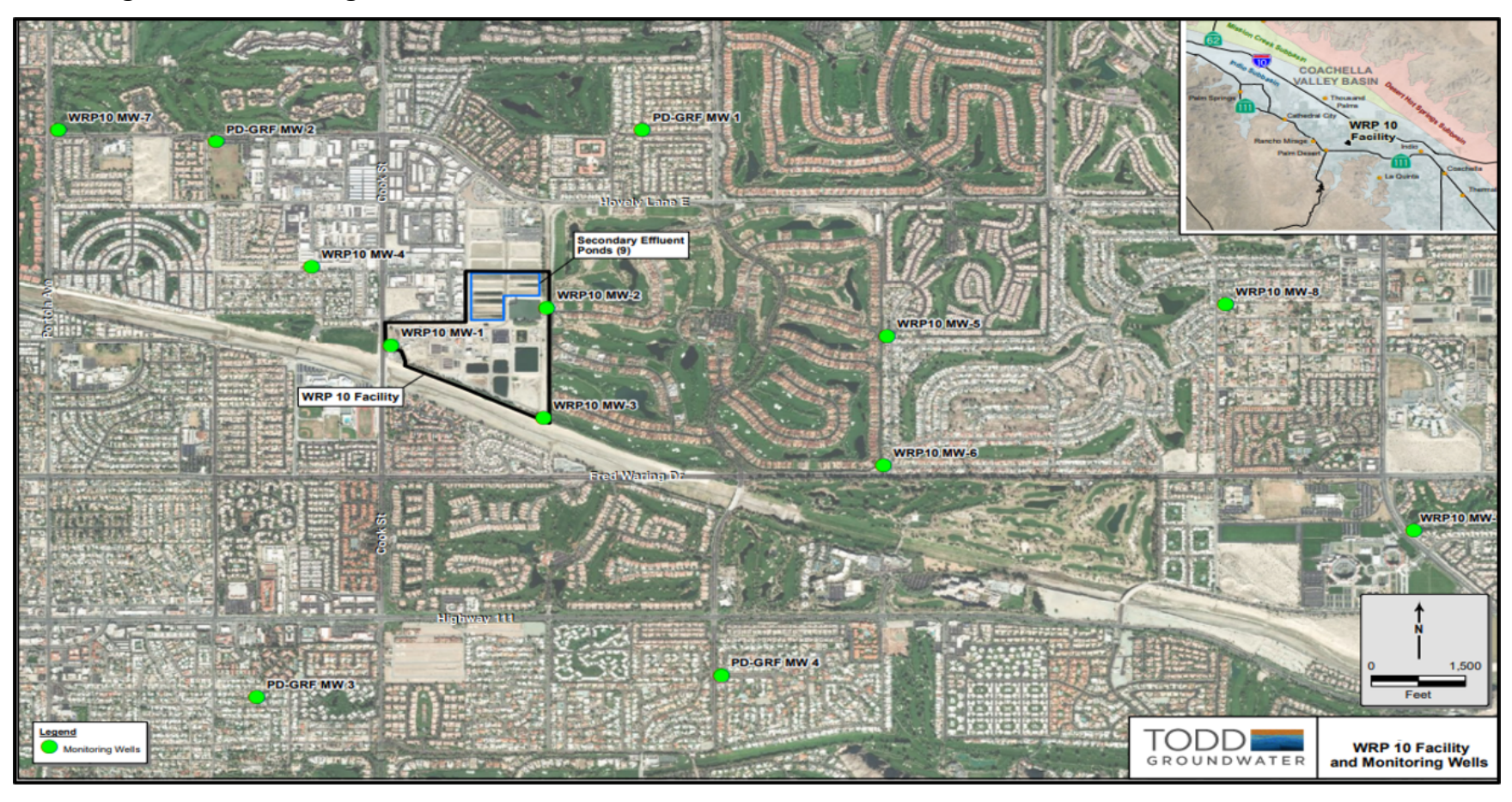
Figure 2. Monitoring Well Locations.