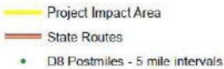
Figure 2: Topographic map showing the Project location.