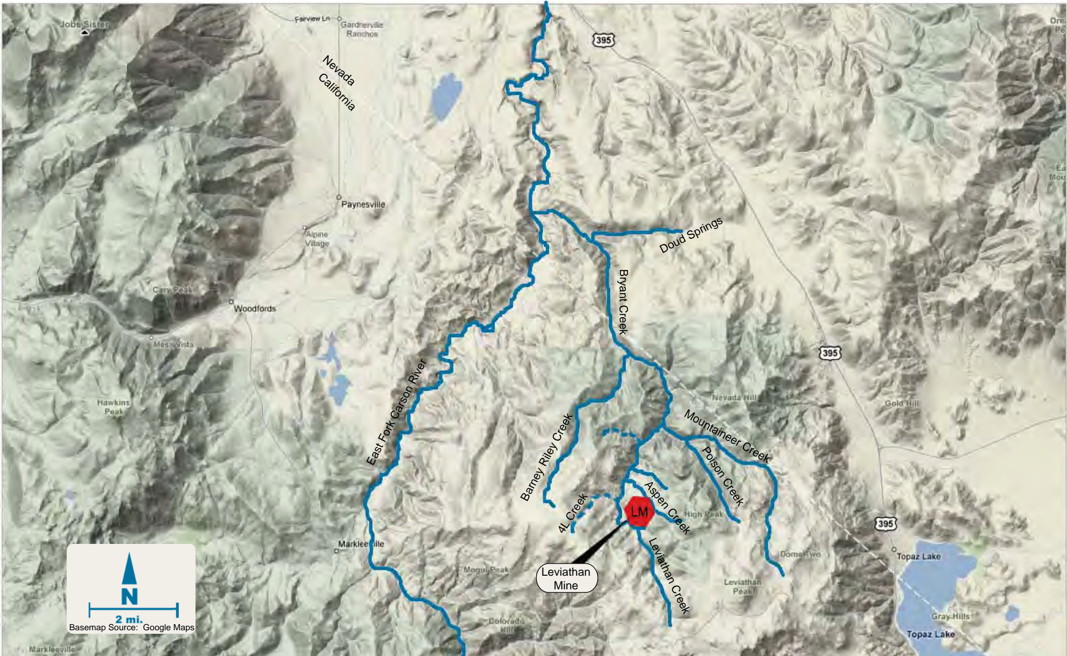
FIGURE 2 BRYANT CREEK WATERSHED