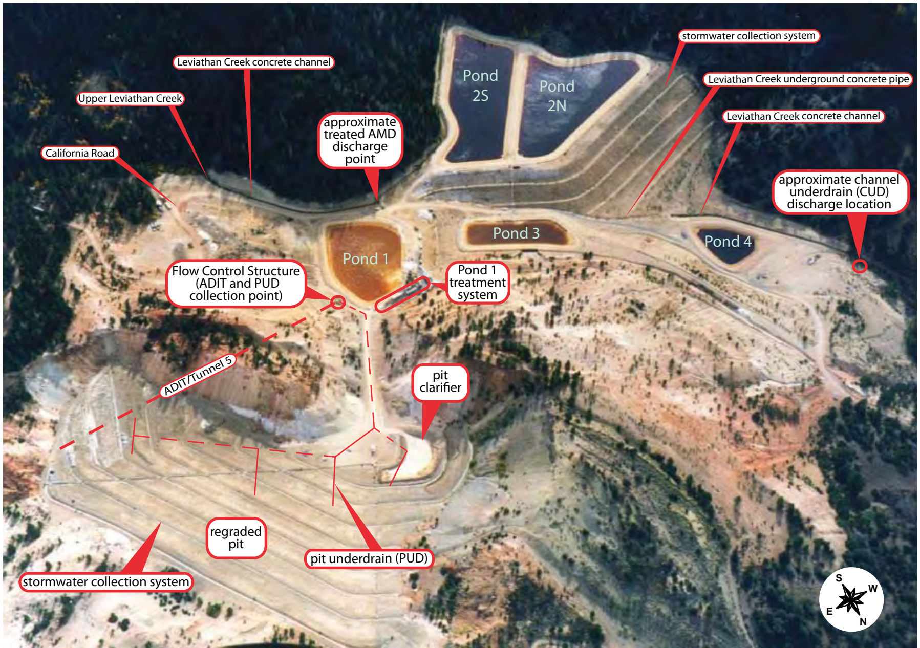
FIGURE 3 LAHONTAN WATER BOARD AMD CAPTURE AND TREATMENT SYSTEM