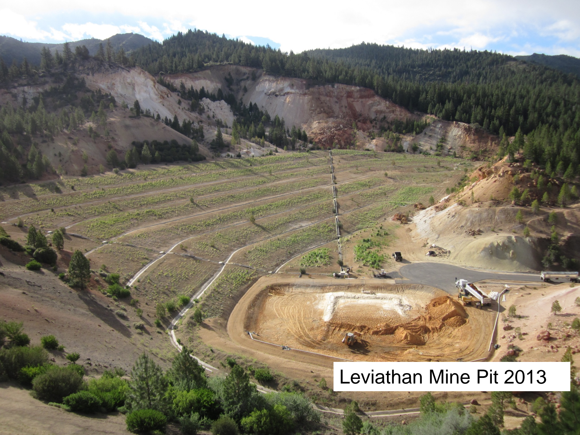
Leviathan Mine Pit 2013