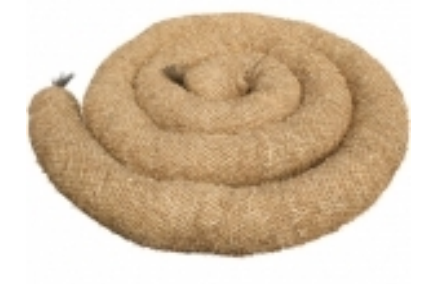
Synthetic and Straw Booms

These photos were obtained from various public websites