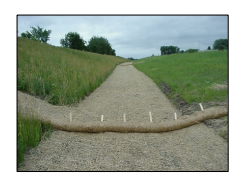
Mats and Wattle Erosion Protection