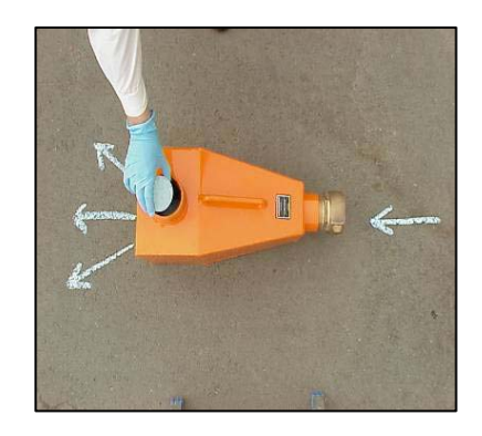
Typical Dechlorinator with De-Chlorination Tablet