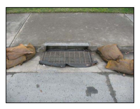
Filter Bag with Sandbags Protecting Municipal Sewer

These photos were obtained from various public websites