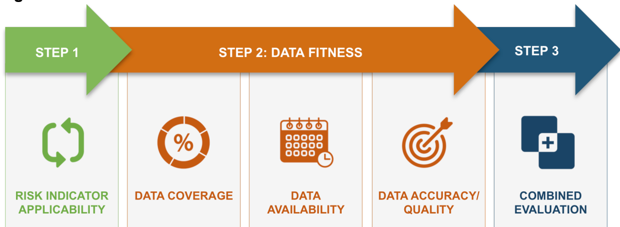
Figure 3: Risk Indicator Evaluation Tool

The Evaluation Tool consists of three steps and utilizes a combination of qualitative and quantitative criteria to evaluate risk indicators: