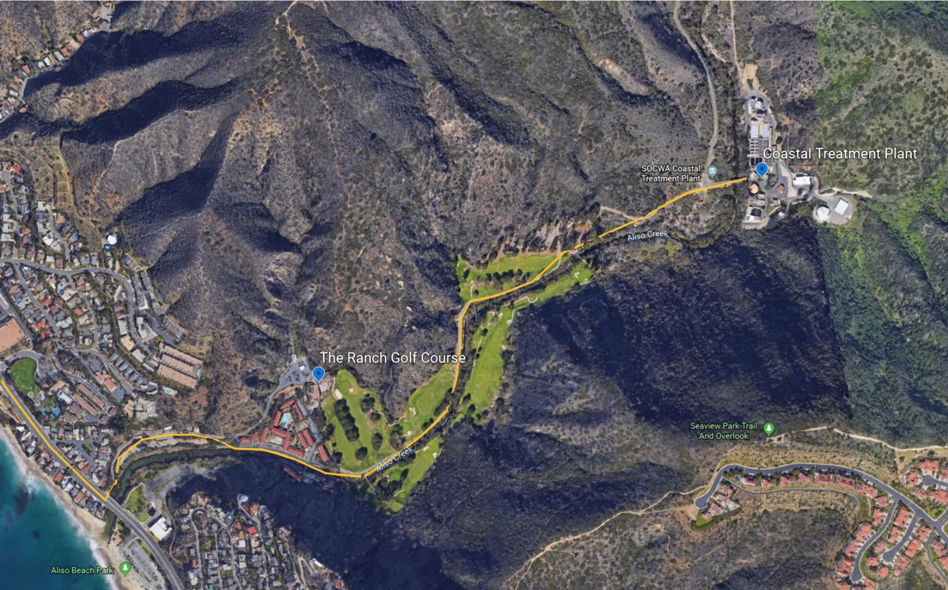
Figure 1 – SITE LOCATION MAP AND BYPASS INFORMATION GRAPHIC