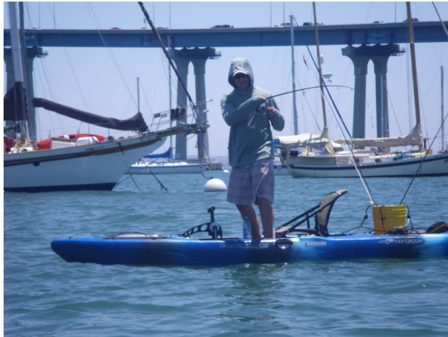
Many participants fished from kayaks providing greater coverage of the bay.