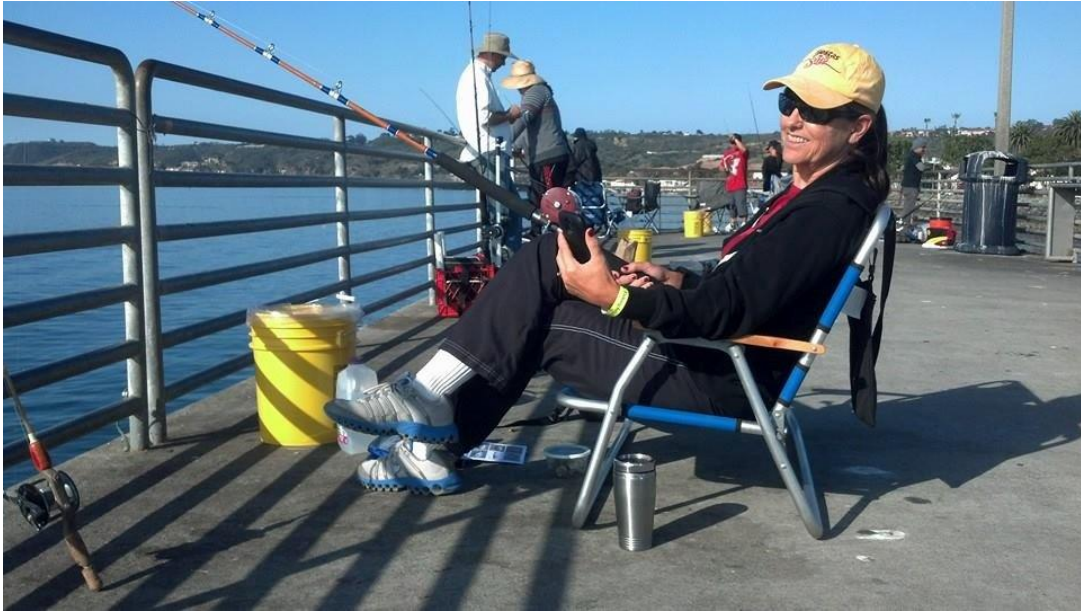
Who knew that scientific data collection could be so fun and relaxing?