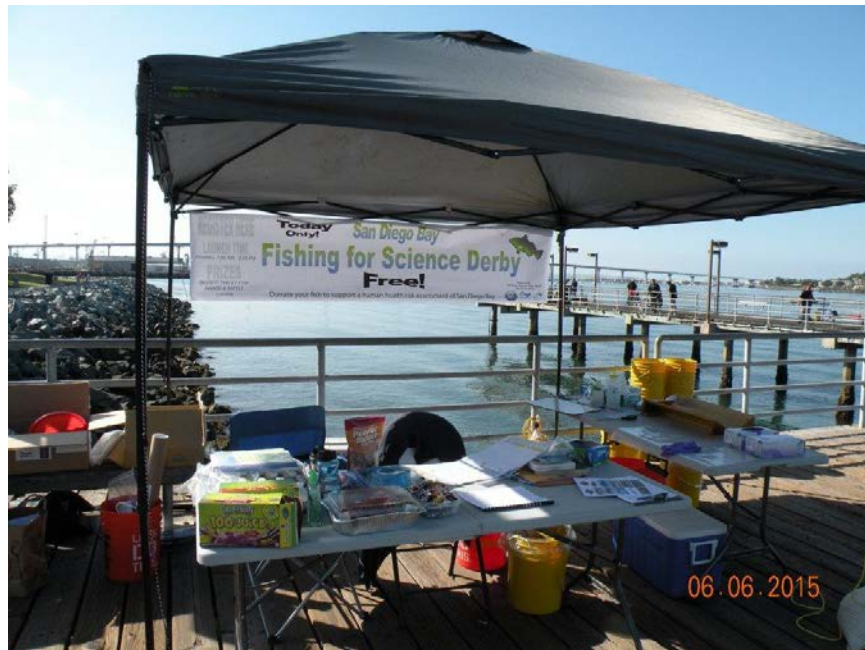
A banner announces the derby at the registration booth at the Embarcadero Pier.