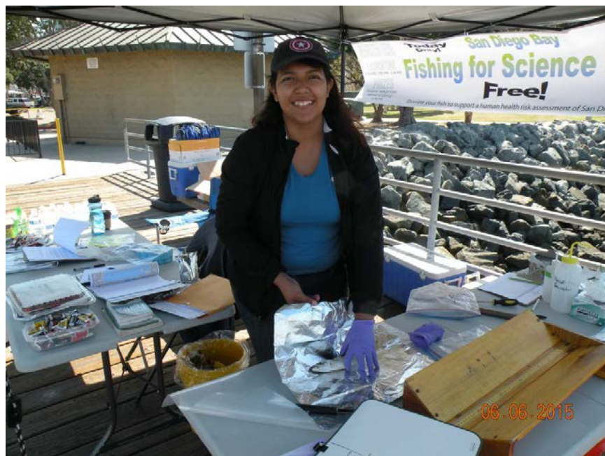
Fish were weighed, measured, wrapped in aluminum foil and put on ice for storage and transport.