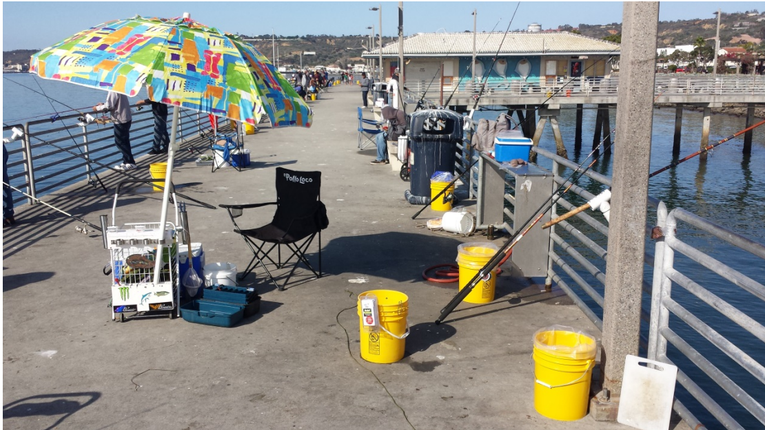
Yellow “Fishing for Science” collection buckets the length of Shelter Island Pier show the strong support for the derby.