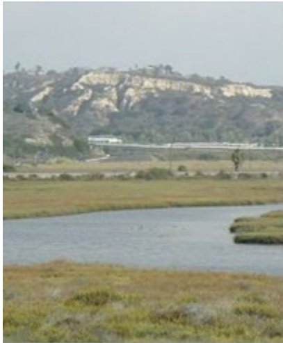
Los Penasquitos Lagoon

Inland Saline Water Habitat (SAL) - Includes uses of water that support inland saline water ecosystems including, but not limited to, preservation or enhancement of aquatic saline habitats, vegetation, fish, or wildlife, including invertebrates.