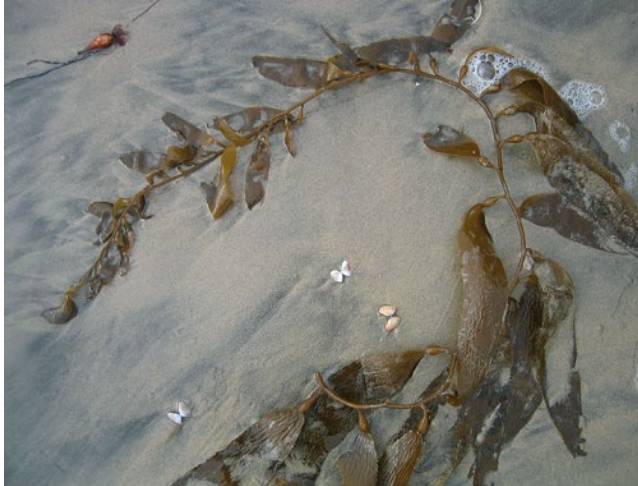
Kelp on beach at San Diego – La Jolla Ecological Reserve

Preservation of Biological Habitats of Special Significance (BIOL) - Includes uses of water that support designated areas or habitats, such as established refuges, parks, sanctuaries, ecological reserves, or Areas of Special Biological Significance (ASBS), where the preservation or enhancement of natural resources requires special protection. Begin proposed text ASBS are those areas designated by the State Water Resources Control Board (State Board) as requiring protection of species or biological communities to the extent that alteration of natural water quality is undesirable.