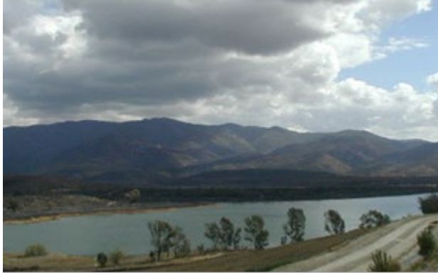
Lower Otay Reservoir