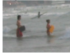
Beachgoers at La Jolla Shores

Hydropower Generation (POW) - Includes uses of water for hydropower generation.