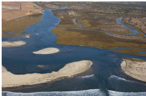
Tijuana River mouth