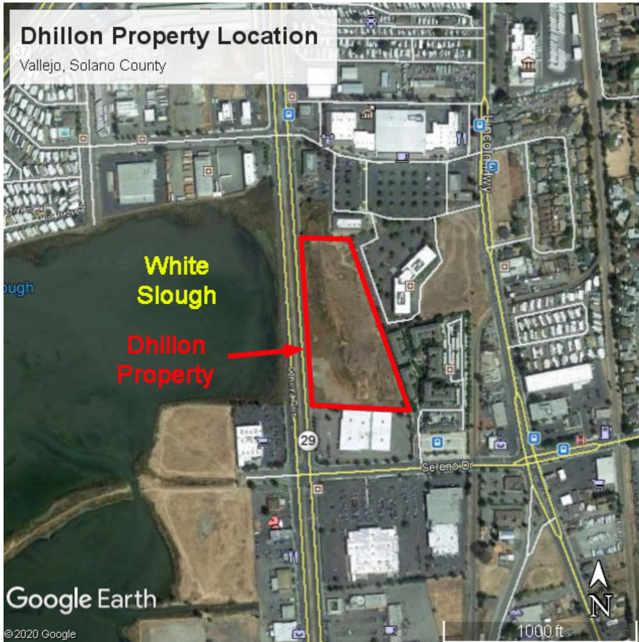
Dhillon Property Site Location

Google Earth imagery, aerial dated 9/1/2018, downloaded on 8/6/2020