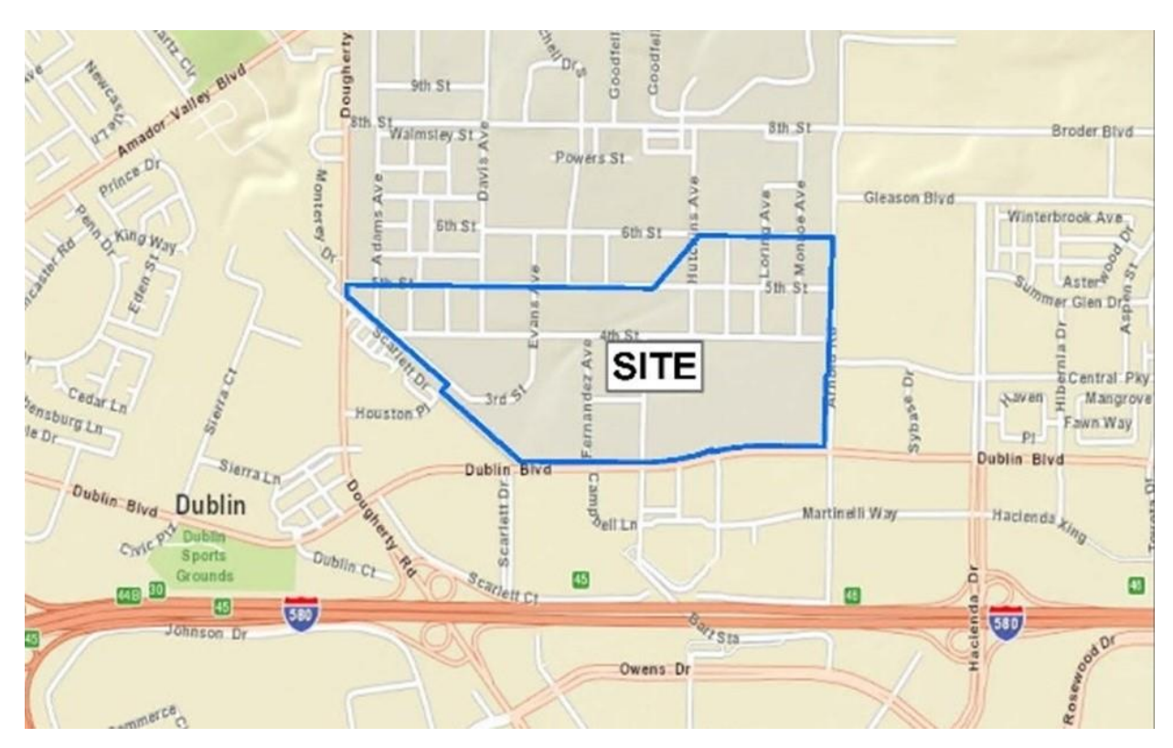
Figure 1: Location of Dublin Crossing / The Boulevard Residential Development

Since 2018, Dublin Crossing LLC and Lennar Homes (Developers) have been constructing a large residential housing development on land that was transferred from the southern portion of Camp Parks Army Base in Dublin, California (see figures 1 and 2 below). The Clean Water Act Section 401 Quality Certification and the Construction Stormwater General Permit allowed the Developers to discharge low turbidity groundwater encountered during construction activities to the storm drain. During the regulatory oversight provided by these permits, Water Board staff discovered that the extracted groundwater contained low concentrations of TCE, which can have adverse impacts on fetal heart tissue at very low concentrations.