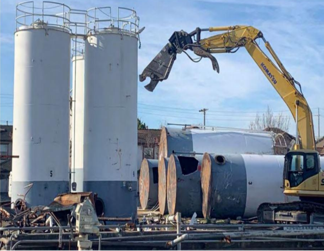
Figures 1 and 2: Above ground storage tanks on the southwest side of the site