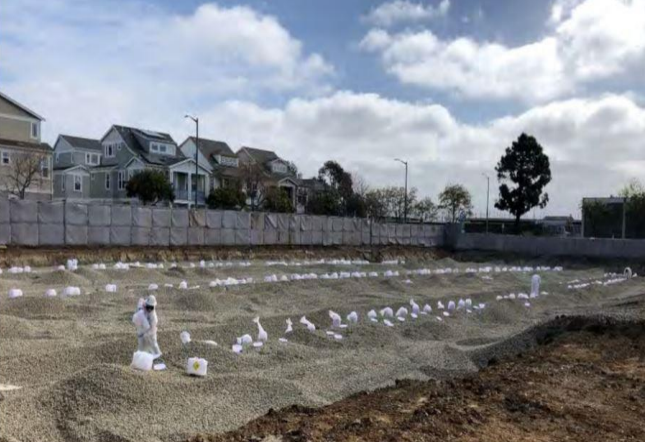
Figures 5 and 6: Excavation and backfill with gravel and ORC application in the northeast portion of the site.