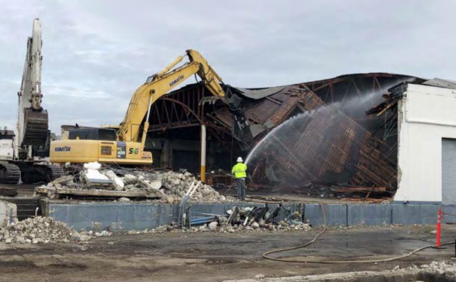
Figures 3 and 4: Main warehouse in the center of the site, along Grand St at the intersection of Clement Ave