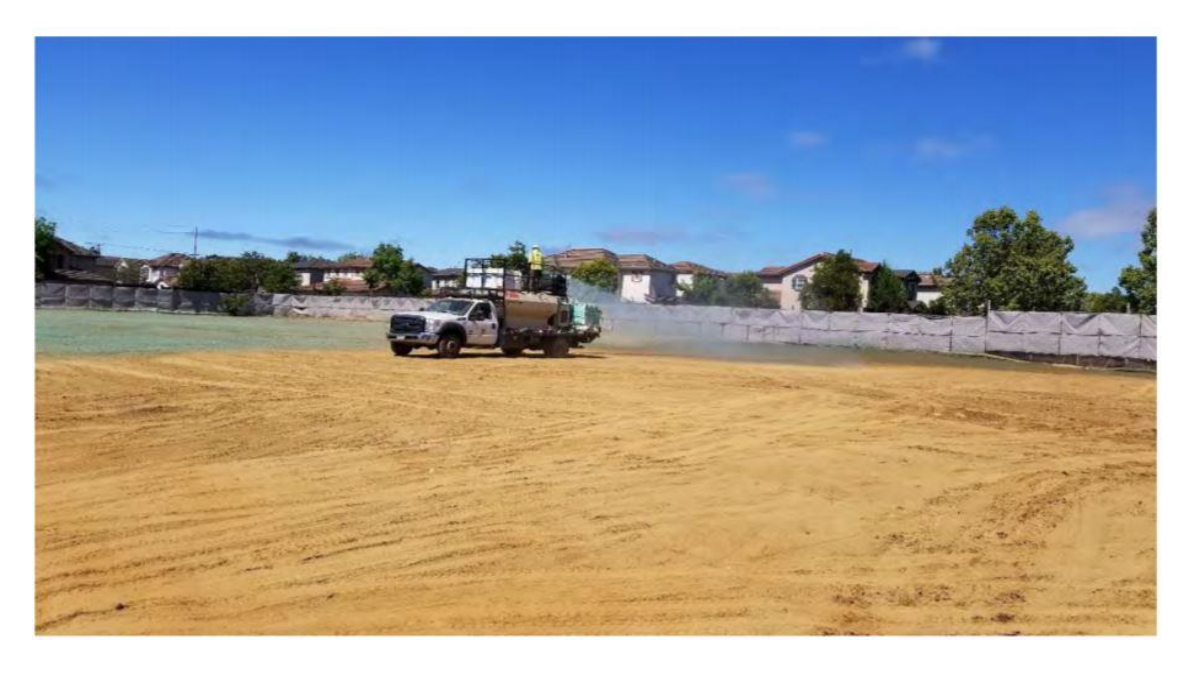
Figure 7: Final grading and hydroseeding after demolition and soil excavation was completed.