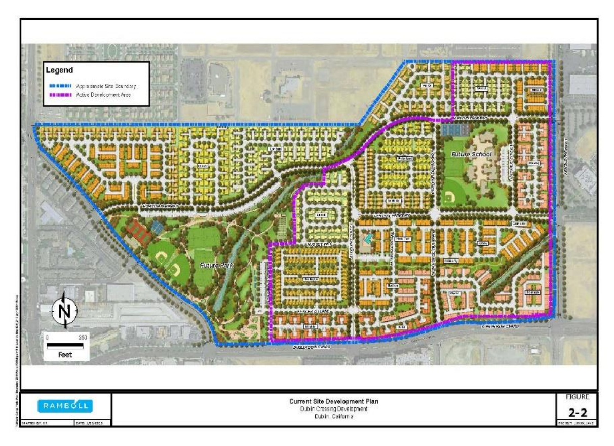
Figure 2: Proposed Residential Development

My staff immediately contacted the Developers to gather additional information related to the source and extent of TCE. It was soon determined that a site-wide investigation was necessary to identify the source and extent of TCE and other potential Volatile Organic Chemicals (VOCs) in groundwater, soil, and soil gas that could adversely impact human health, as new residential units were already being occupied.