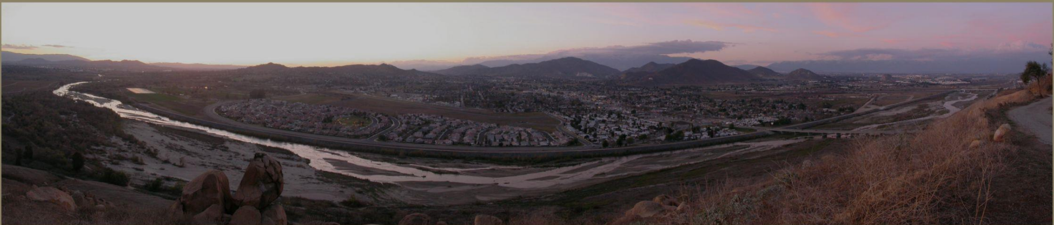
Santa Ana River