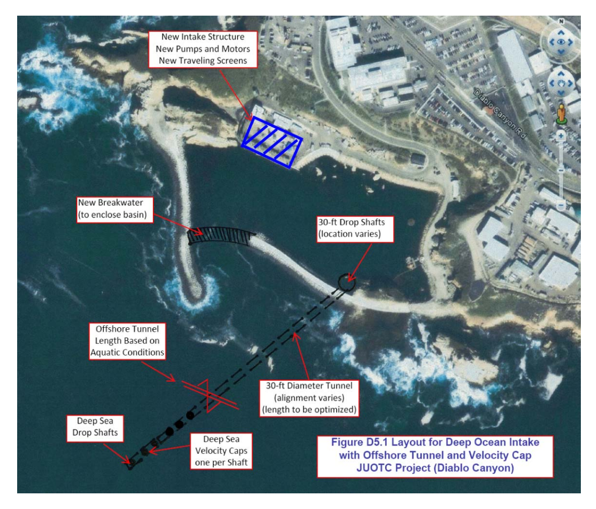
Figure DW-1. Layout for Deep Ocean Intake with Offshore Tunnel and Velocity Cap