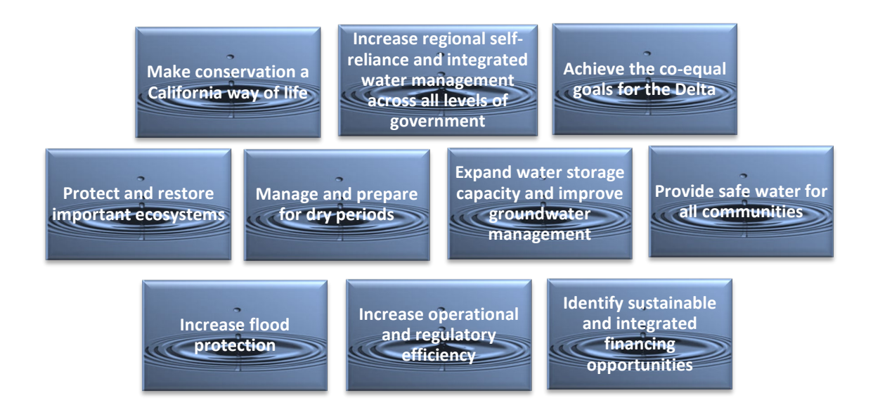
Figure 2. California Water Plan Action Items

This Storm Water Strategy further emphasizes and supports the following actions identified in the California Water Action Plan: