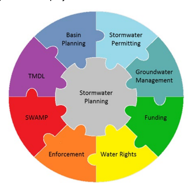
Figure 3. Storm Water Planning Interconnectivity with Water Board Programs

The Storm Water Planning Unit will collaborate with other related Water Board programs including but not limited to, storm water permitting, basin planning, TMDLs, Surface Water Ambient Monitoring Program (SWAMP), enforcement, water rights, funding, and groundwater management, to ensure that input, updates, and assistance are provided holistically from a Water Boards perspective (Figure 3). In addition, the Water Boards have assigned four Executive Sponsors, along with committed participation from staff in four Regional Water Boards (San Diego, Los Angeles, Central Coast, and North Coast) to assist and provide regional expertise and guidance for project outcomes.