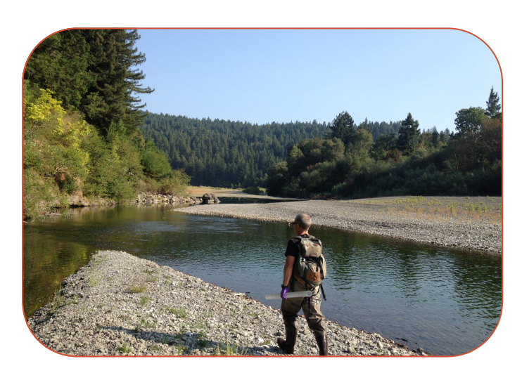
Sampling the Navarro River in Mendocino County.

SPoT will continue to focus on chemicals of emerging concern. In 2015 SPoT will be adding an additional indicator organism to assess the effects of fipronil and its degradates. Chironomus dilutus will be tested in sediments from urban stations. SPoT is also exploring the possibility of incorporating water column monitoring for imidacloprid and other neonicotinoid pesticides beginning in 2016. In collaboration with DPR and SWAMP, a pilot monitoring project is measuring these pesticides in agricultural streams in 2014 and assessing their effect using C. dilutus . Legacy pesticides (DDT), PCBs, organophosphate pesticides and metals will be monitored every other year.