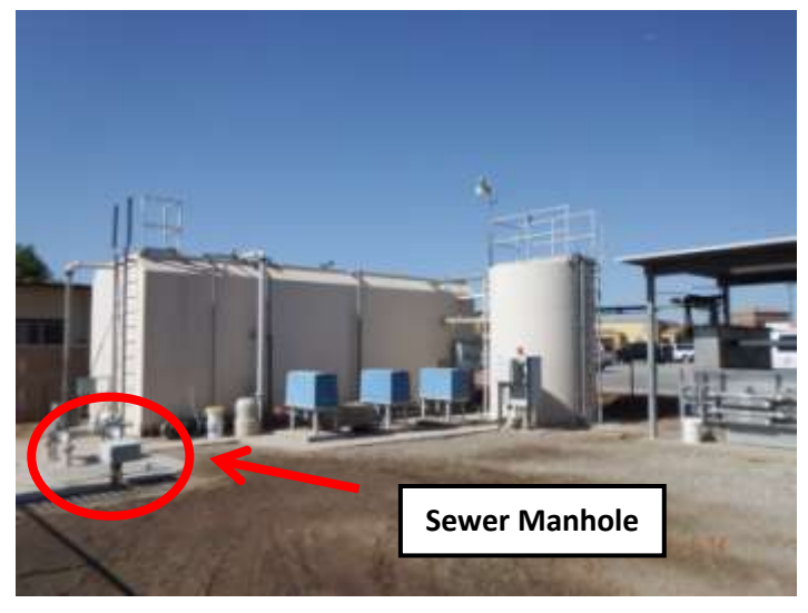
Pump system pumping water from existing Sewer Manhole to existing WWTP.