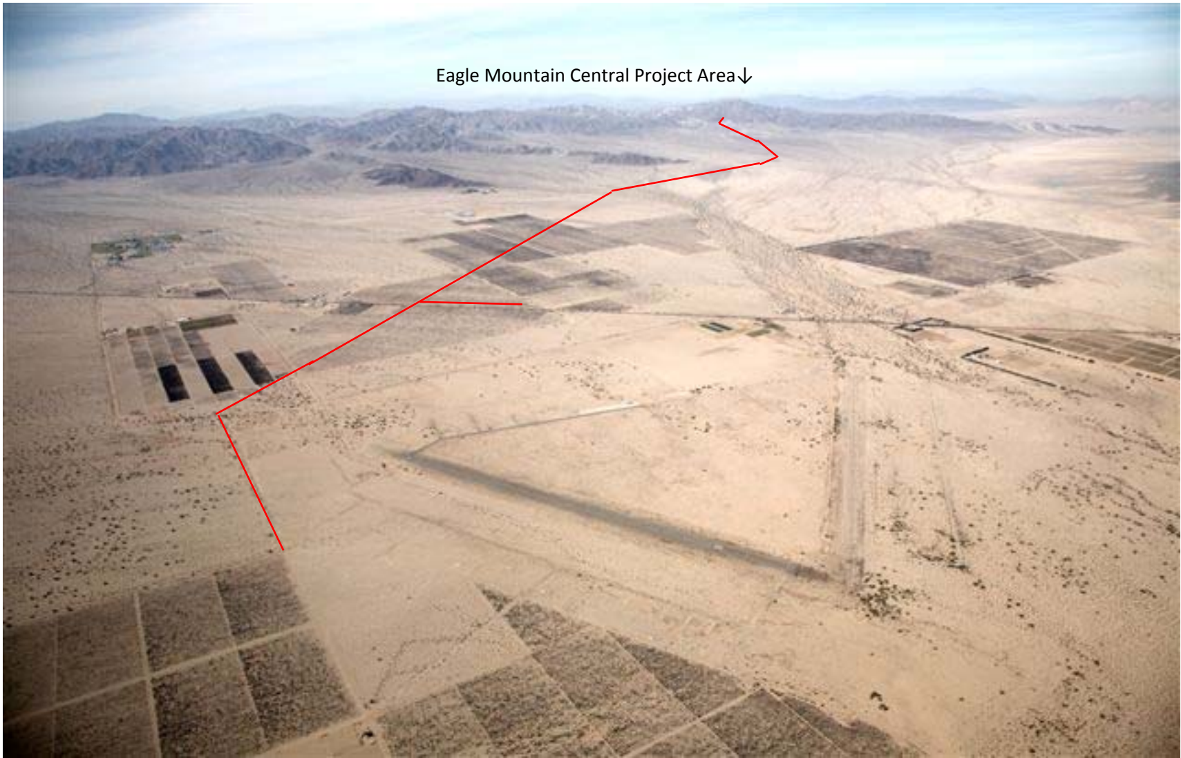
Figure 3.0-2. Aerial view of water pipeline corridor, November 2008, from southeast towards the northwest.

The Central Project Area is visible in the background.