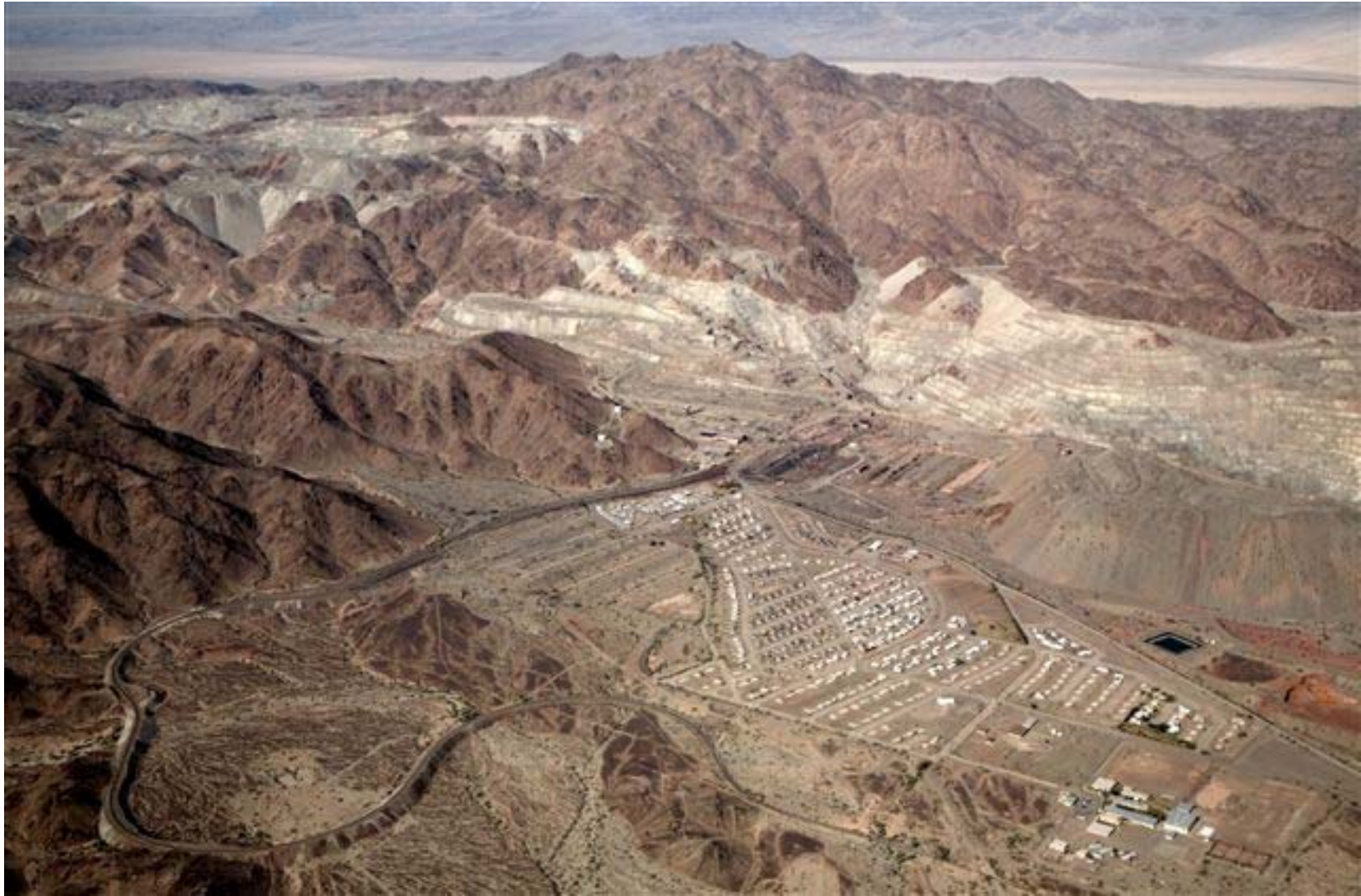
Figure 3.0-3. Aerial view of the town of Eagle Mountain.