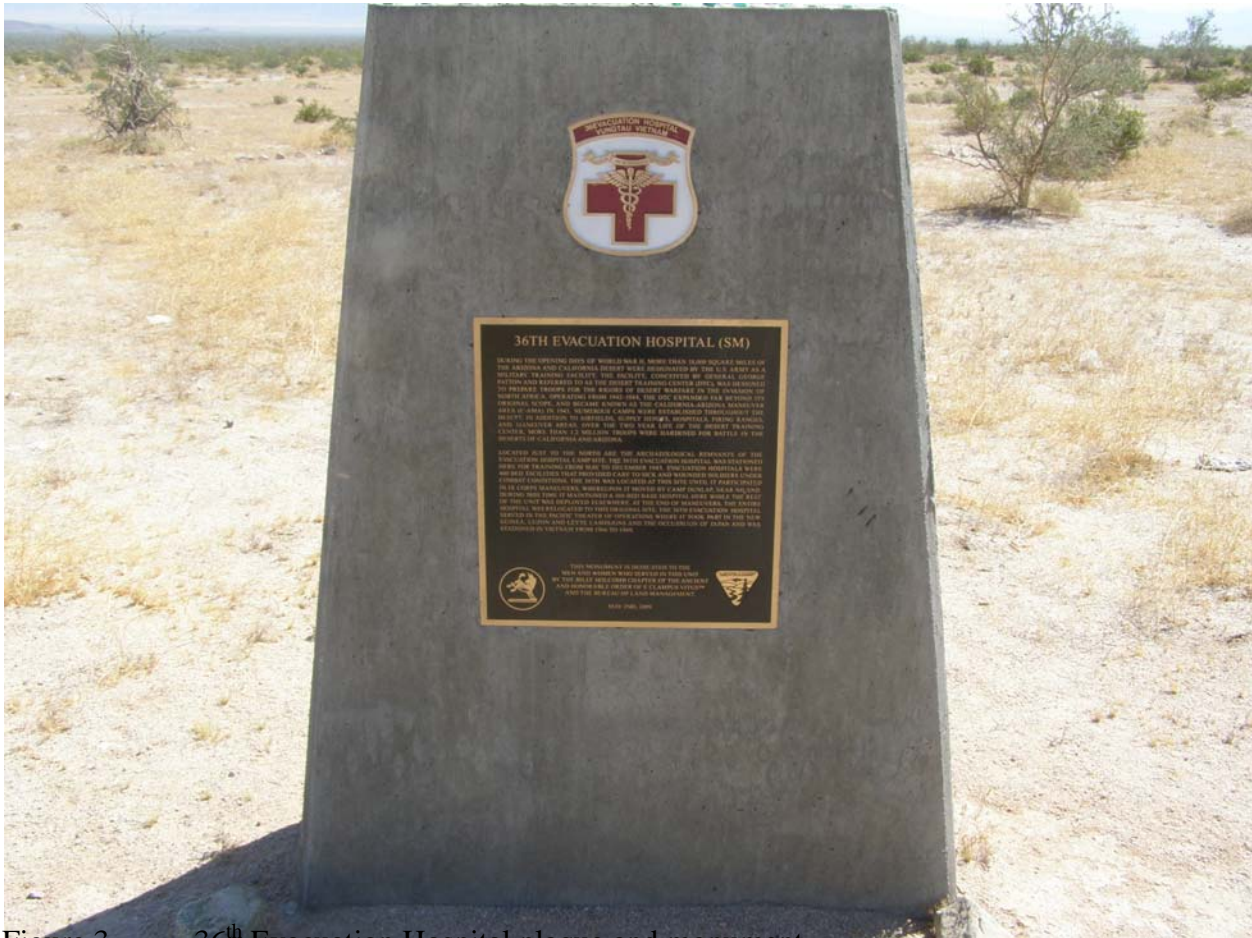
Figure 3. 36<sup>th</sup> Evacuation Hospital plaque and monument.