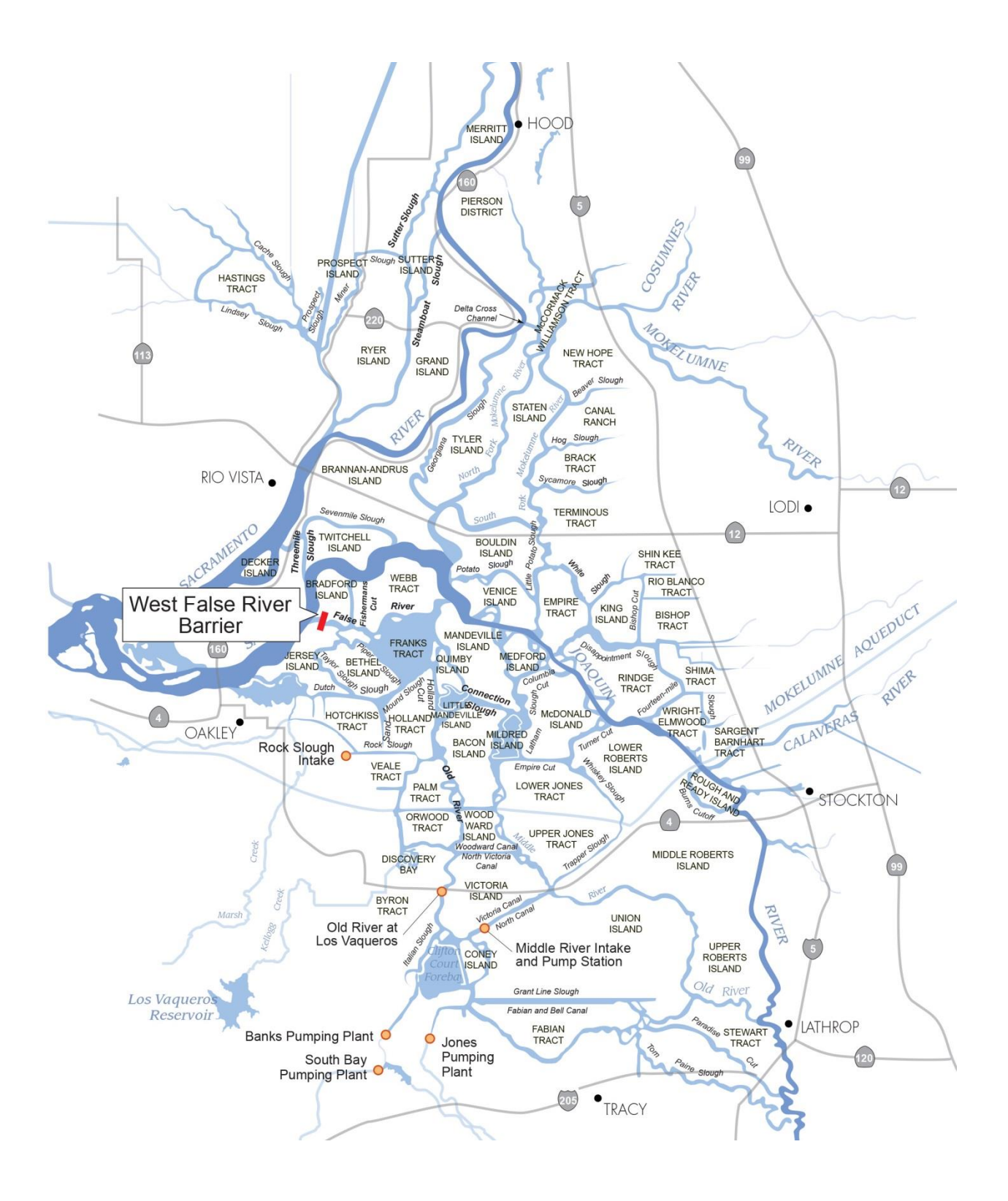
Figure 1. Emergency Drought Barrier Location