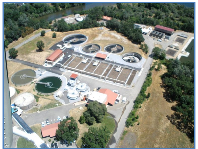
Clear Creek Wastewater Treatment Plant, Redding CA, photograph courtesy of Central Valley Regional Water Quality Control Board

The Water Boards released its fourth Web-based <u>Performance Report</u> in September 2012. To improve transparency and accountability, a key priority for the Water Boards, the Performance Report is designed to provide information on efforts to protect and allocate the state's waters for beneficial uses.