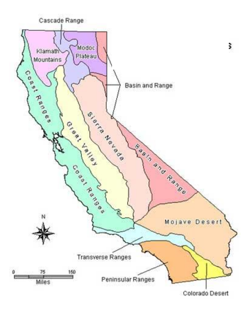
Figure 1. California Geomorphic Provinces

Alternatively, the Permittee may use a geomorphically based hydromodification standard or set of standards and analysis procedures designed to ensure that Regulated Projects do not cause a decrease in lateral (bank) and vertical (channel bed) stability in receiving stream channels. The alternative hydromodification standard or set of standards and analysis procedures must be reviewed and approved by the Regional Board Executive Officer.