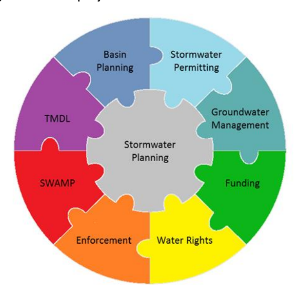
Figure 3. Storm Water Planning Interconnectivity with Water Board Programs

The Storm Water Planning Unit will collaborate with other related Water Board programs including but not limited to, storm water permitting, basin planning, TMDLs, Surface Water Ambient Monitoring Program (SWAMP), enforcement, water rights, funding, and groundwater management, to ensure that input, updates, and assistance are provided holistically from a Water Boards perspective (Figure 3). In addition, the Water Boards have assigned four Executive Sponsors, along with committed participation from staff in four Regional Water Boards (San Diego, Los Angeles, Central Coast, and North Coast) to assist and provide regional expertise and guidance for project outcomes.