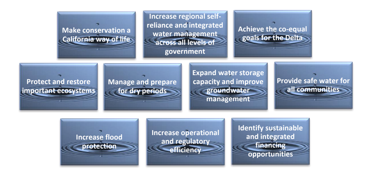
Figure 2. California Water Plan Action Items

This Storm Water Strategy further emphasizes and supports the following actions identified in the California Water Action Plan: