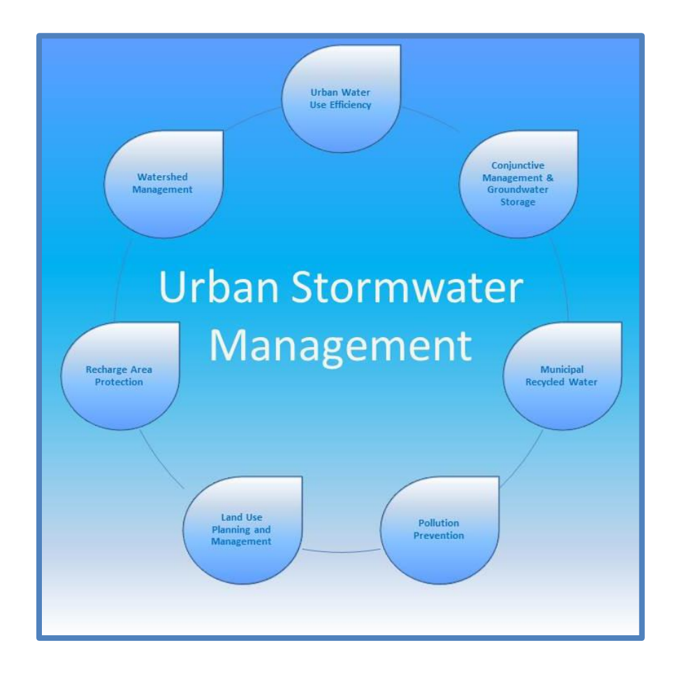
Figure 1. Urban Stormwater Runoff Management