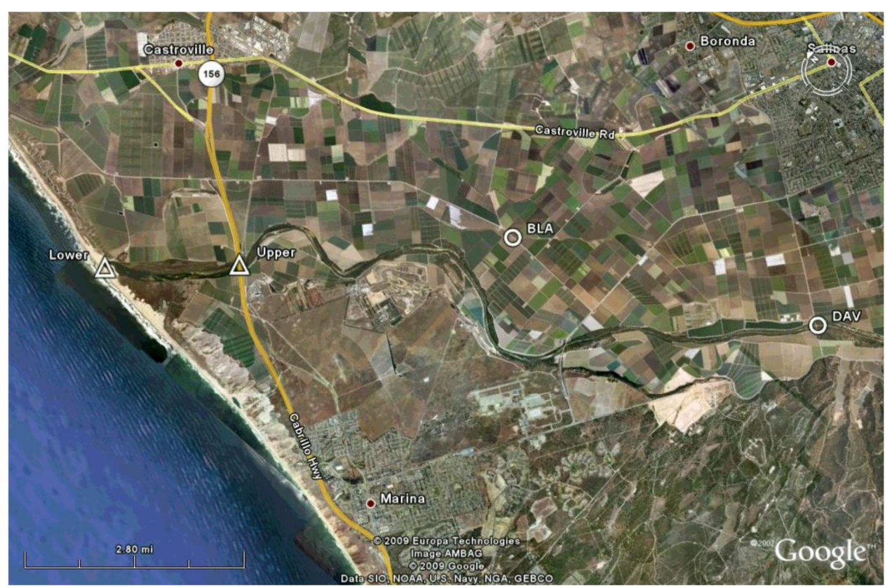
Figure 3. Map of the two Salinas River tributary stations (circles), Blanco Drain at Cooper Road (BLA) and the Salinas River at Davis Road (DAV).

Trends in Chemical Contamination, Toxicity and Land Use in California Watersheds: Stream Pollution Trends (SPoT) Monitoring Program Third Report - Five-Year Trends 2008-2012 (Phillips et al., 2014)