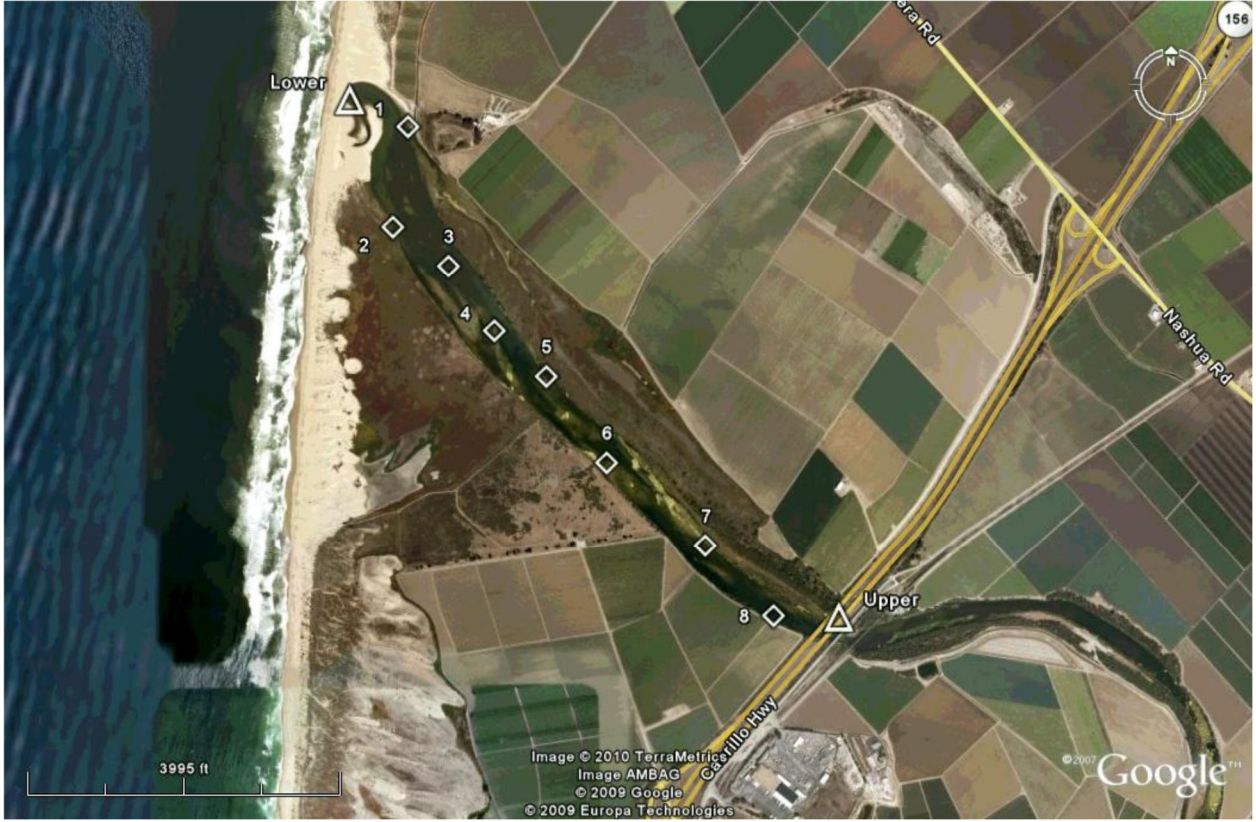
Figure 2. Map of the Salinas River estuary showing the eight sediment sampling stations (diamonds 1-8) and the five benthic community sampling stations (diamonds 1-5). The upper and lower estuary water toxicity and chemistry stations are depicted with triangles.

Notes: Mean percent survival (standard deviation) and organic carbon-corrected toxic unit (TU) sums for Salinas River sediment tests. The chemicals driving the sum TU are listed for sum TU > 0.1