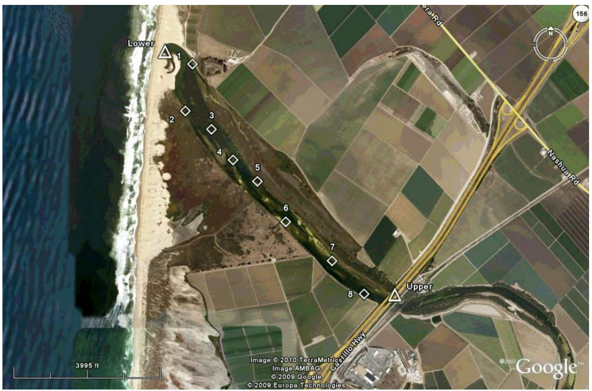
Figure 2. Map of the Salinas River estuary showing the eight sediment sampling stations (diamonds 1-8) and the five benthic community sampling stations (diamonds 1-5). The upper and lower estuary water toxicity and chemistry stations are depicted with triangles.

Notes: Mean percent survival (standard deviation) and organic carbon-corrected toxic unit (TU) sums for Salinas River sediment tests. The chemicals driving the sum TU are listed for sum TU > 0.1