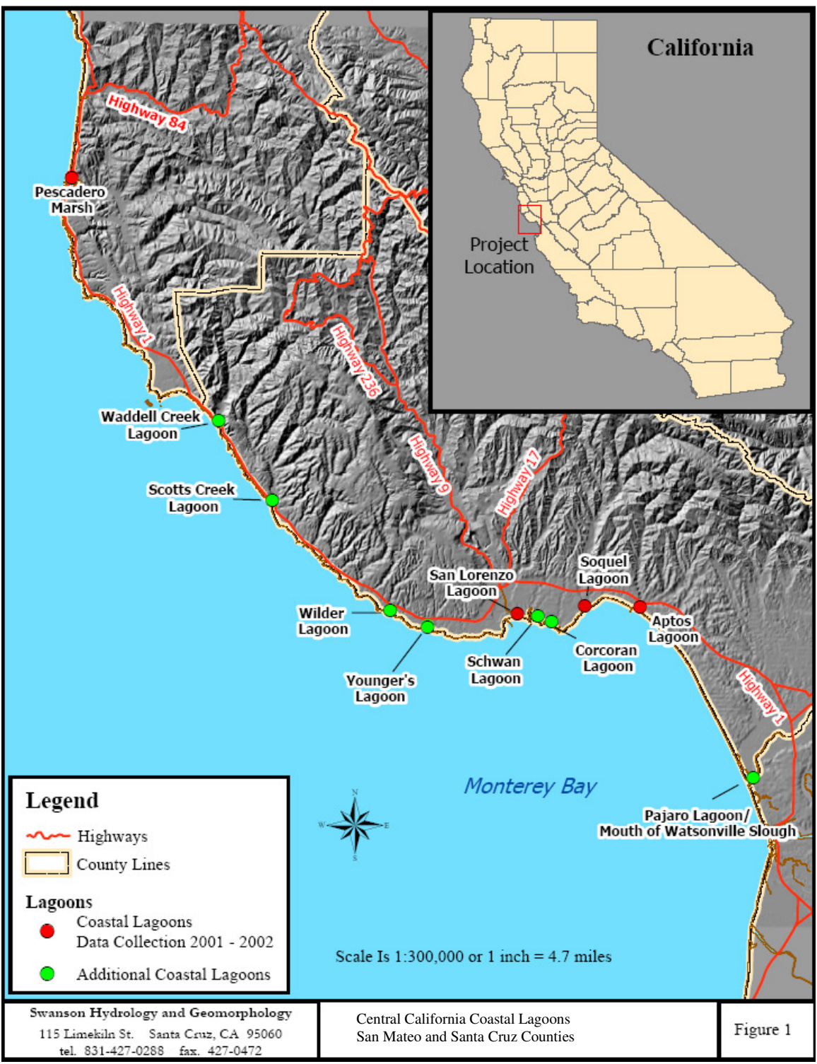
Figure 1: Map of Santa Cruz area (Swanson Hydrology)

The following watershed characterization is from a State Water Resources Control Board draft staff report (SWRCB, 1982, pp. 12) regarding San Lorenzo River Estuary. We are