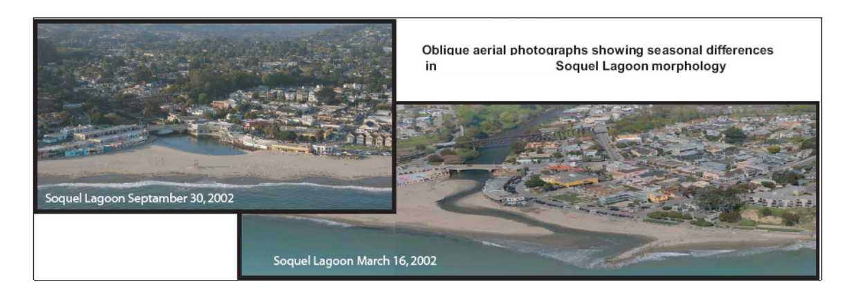
Figure 3: Photos of Soquel Lagoon