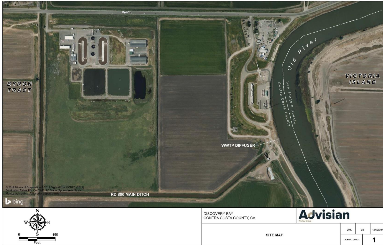
Figure 2 – Impacts to Waters of the United States