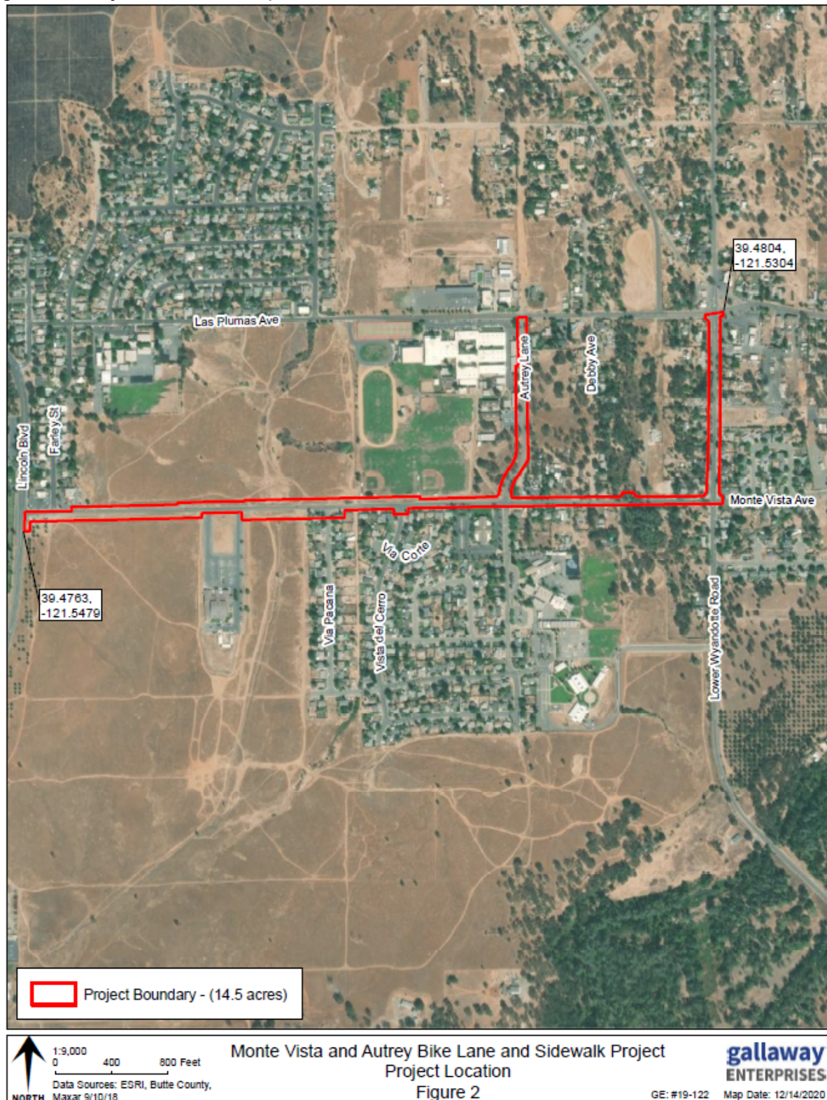
Figure 1: Project location map