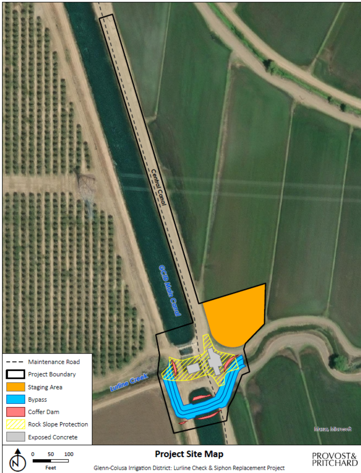
Figure 3: Site Map