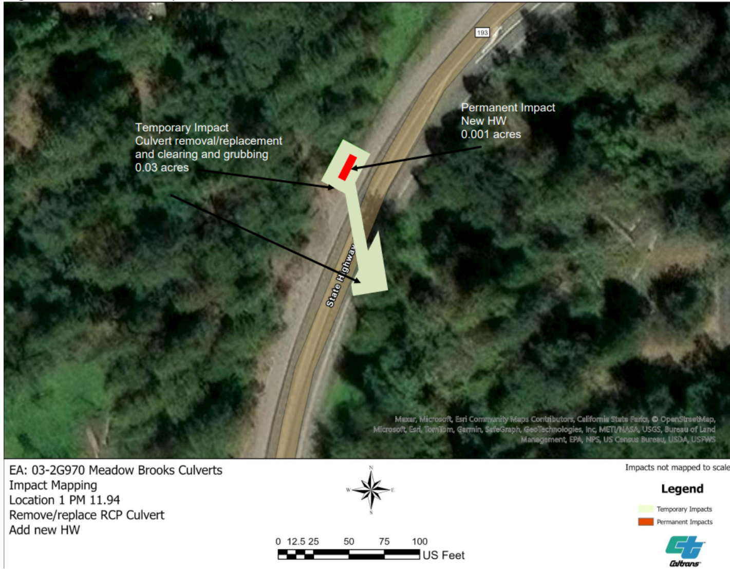
Figure 1: Location 1 Impact Maps