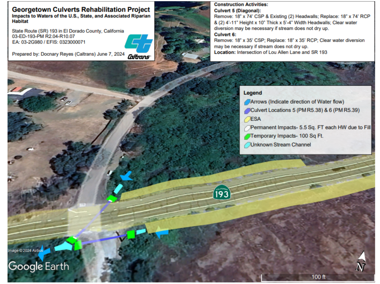
Figure 2: Location 5