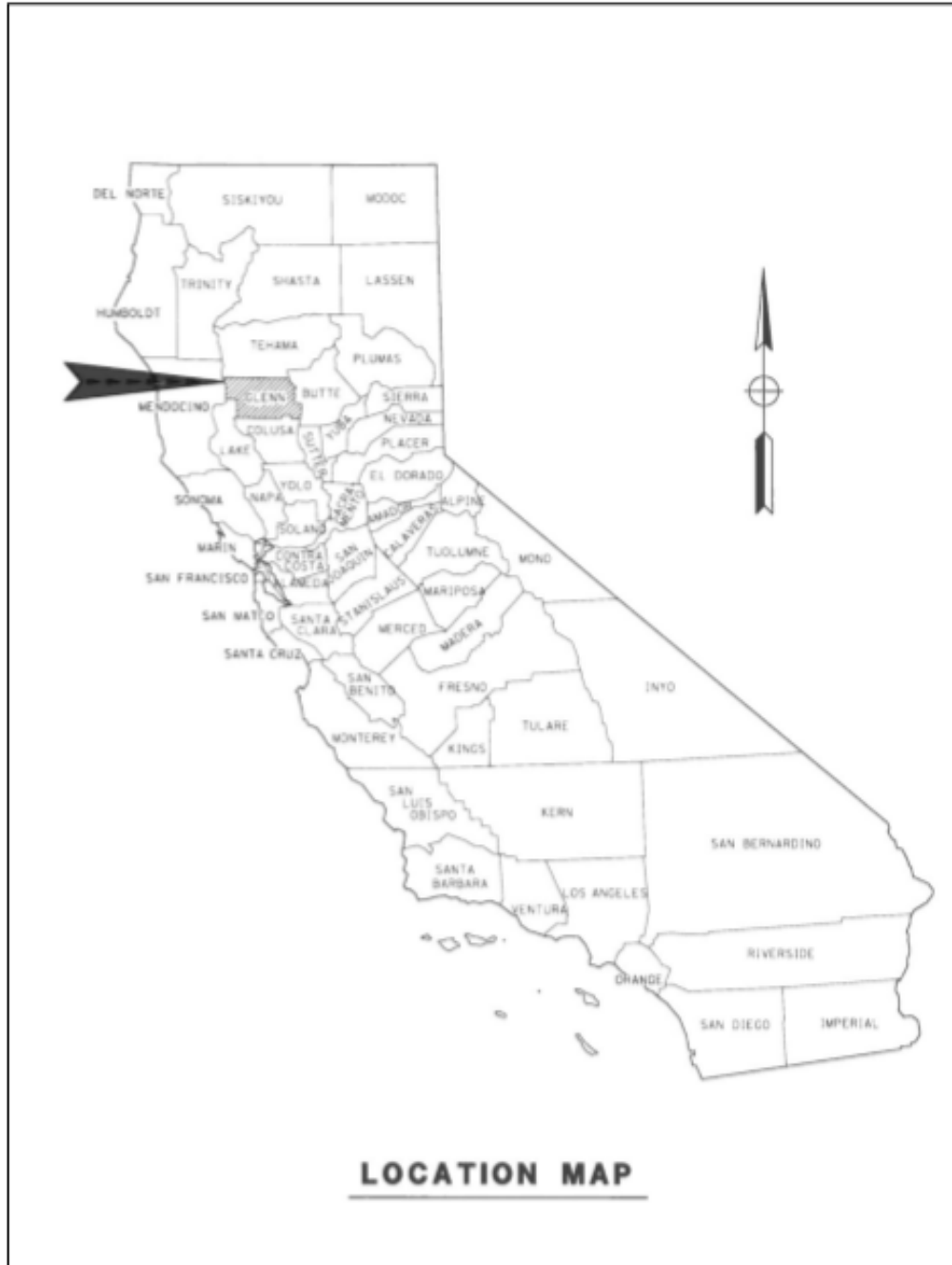
Figure 1 Regional Location Map