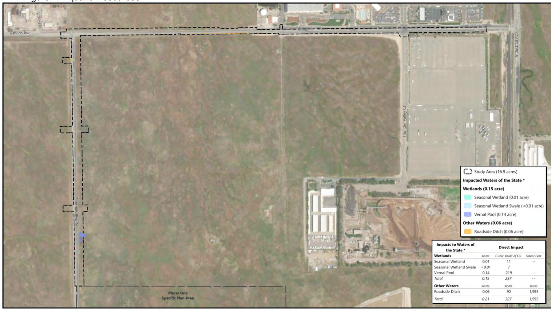
Figure 2: Aquatic Resources