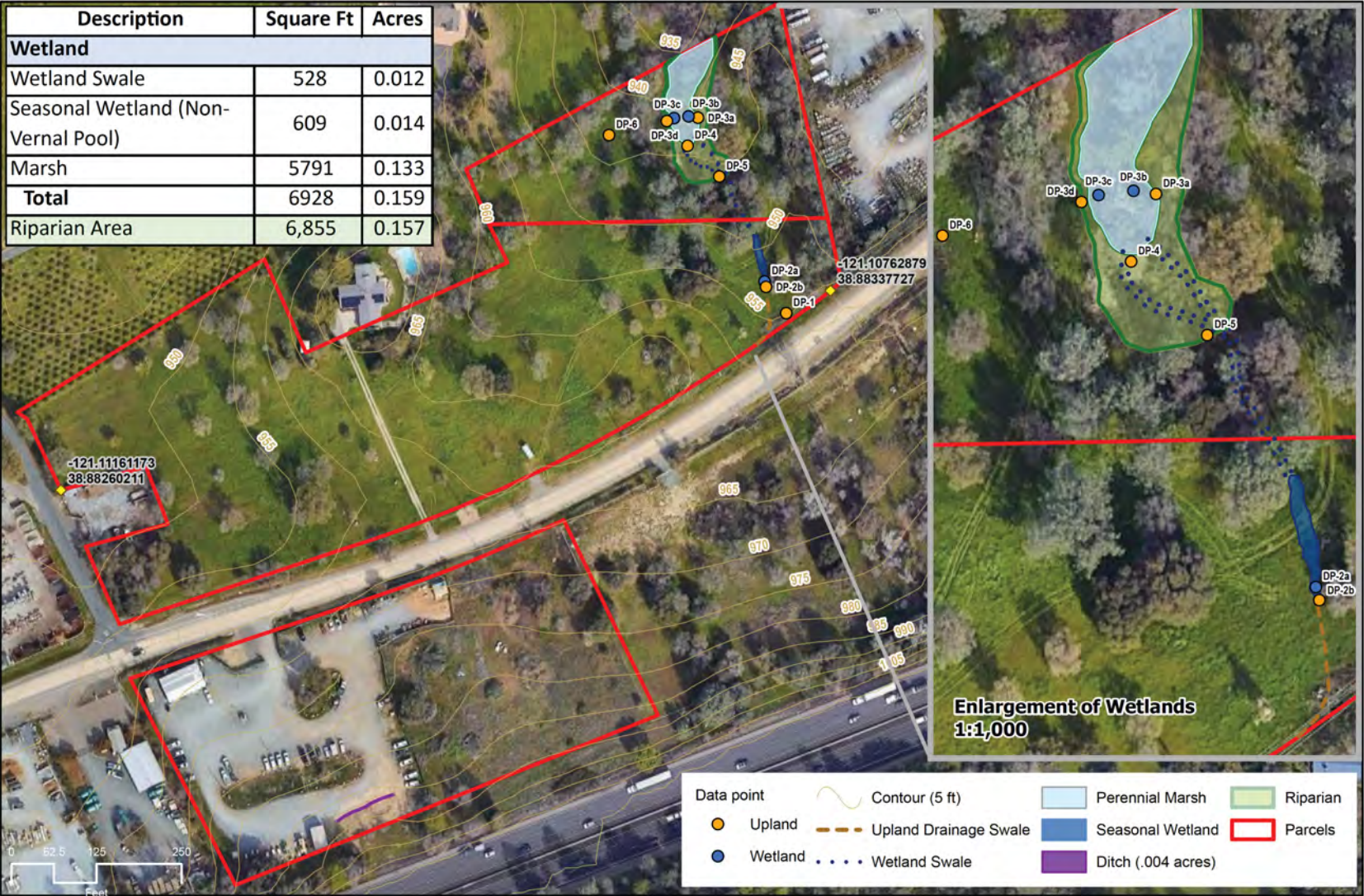
FIGURE 5 - FIELD-DELINEATED WETLANDS AND "OTHER WATERS OF THE U.S."