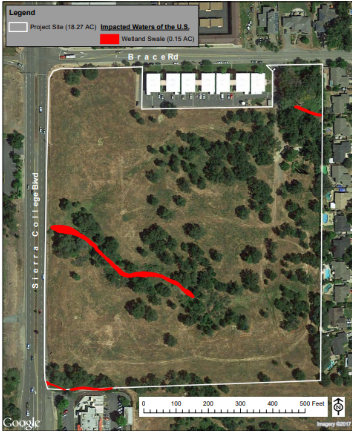
Figure 6. Impacts to Wetlands and Waters of the U.S. Potentially Subject to Corps Jurisdiction Costco Retail Warehouse Loomis Project Town of Loomis, Placer County, California